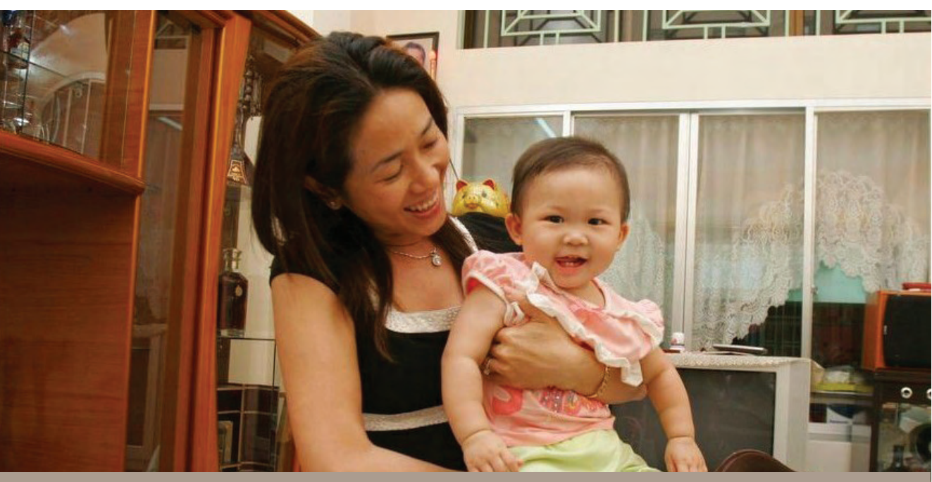
Pictured with her daughter, a Vietnamese woman who reacquired her Vietnamese nationality thanks to the Government's restoration measures.