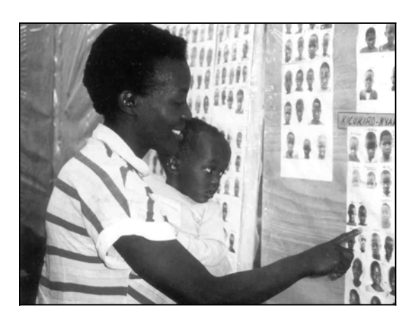
Displaying photographs rekindles a parent or relative's hope of tracing and finding their lost child. Gama, United Republic of Tanzania.

rigorous organization . Although individuals are encouraged to undertake their own searches for their missing children, agencies that cannot