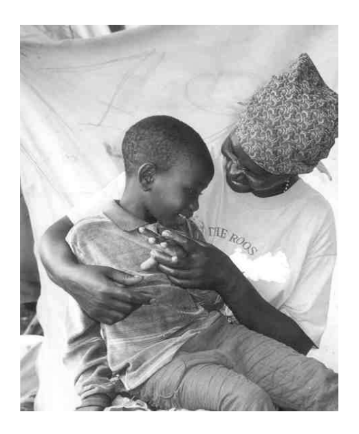
Mother and child reunited through photo-tracing. Goma, United Republic of Tanzania.

If possible, follow-up visits should be made to the family for a short time after the reunification to ensure the child has assimilated, both in terms of meeting basic needs and providing emotional continuity.