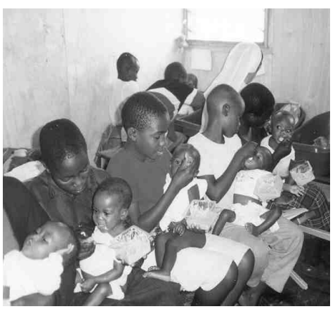
Recreating a family-like environment in an institution is important to the well-being of babies and young children. Goma, United Republic of Tanzania.