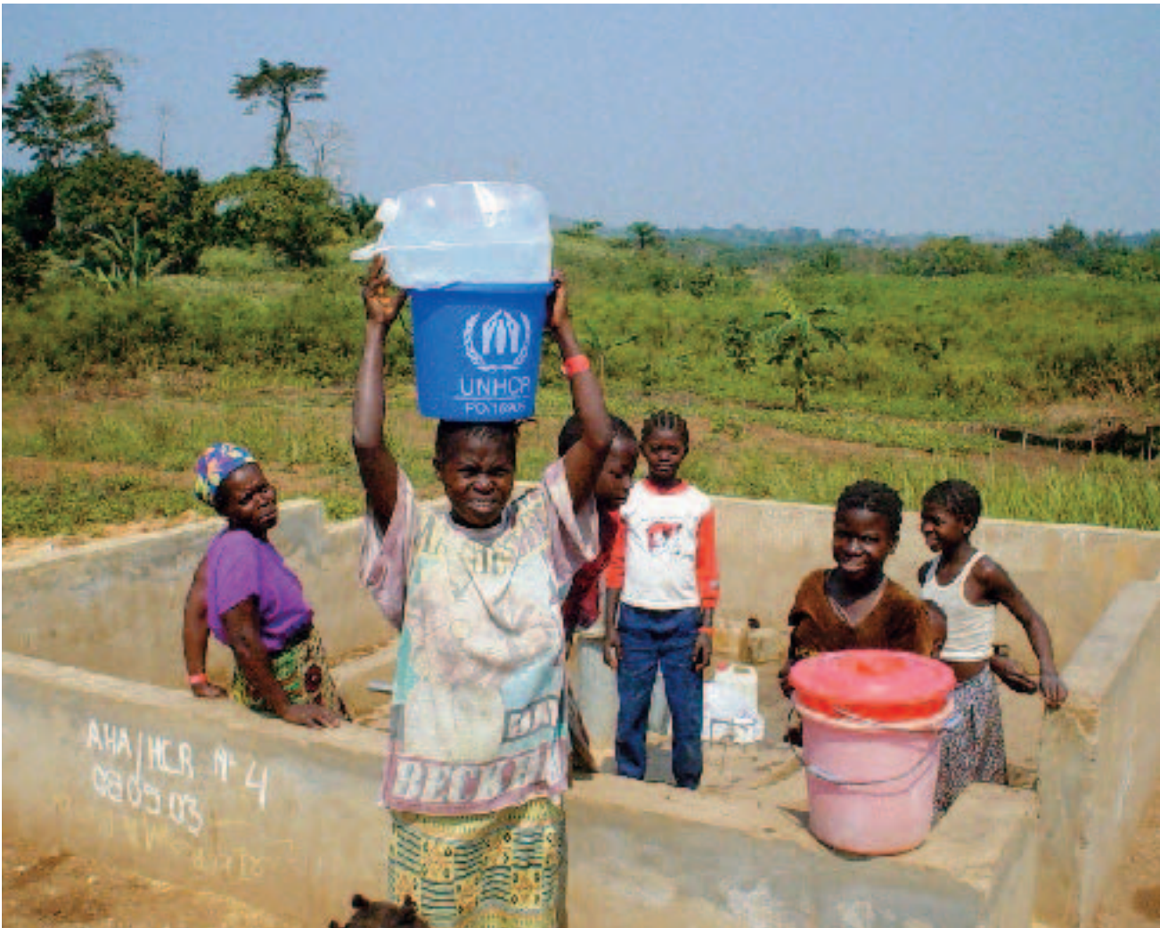
Angola: Returnees from Zambia who receive basic assistance from UNHCR in Cazombo.

UNHCR will develop partnerships with and organise workshops for other UN agencies and NGOs to carry out monitoring and protection activities.