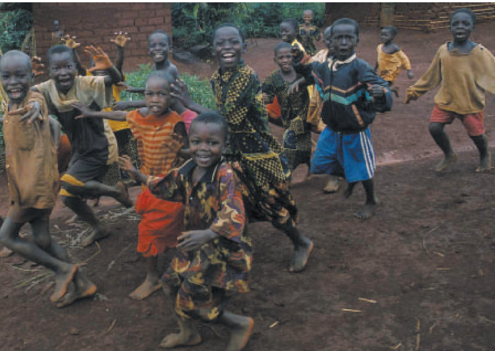
Refugee children from Rwanda and Burundi in Mkugwa camp, Kibondo, take time out for recreation.

The majority of the 154,000 Congolese refugees currently living in Tanzania are from the Kivu Provinces. They are likely to remain in the country until there is a significant improvement in the security situation in eastern DRC. In 2005, UNHCR will focus its