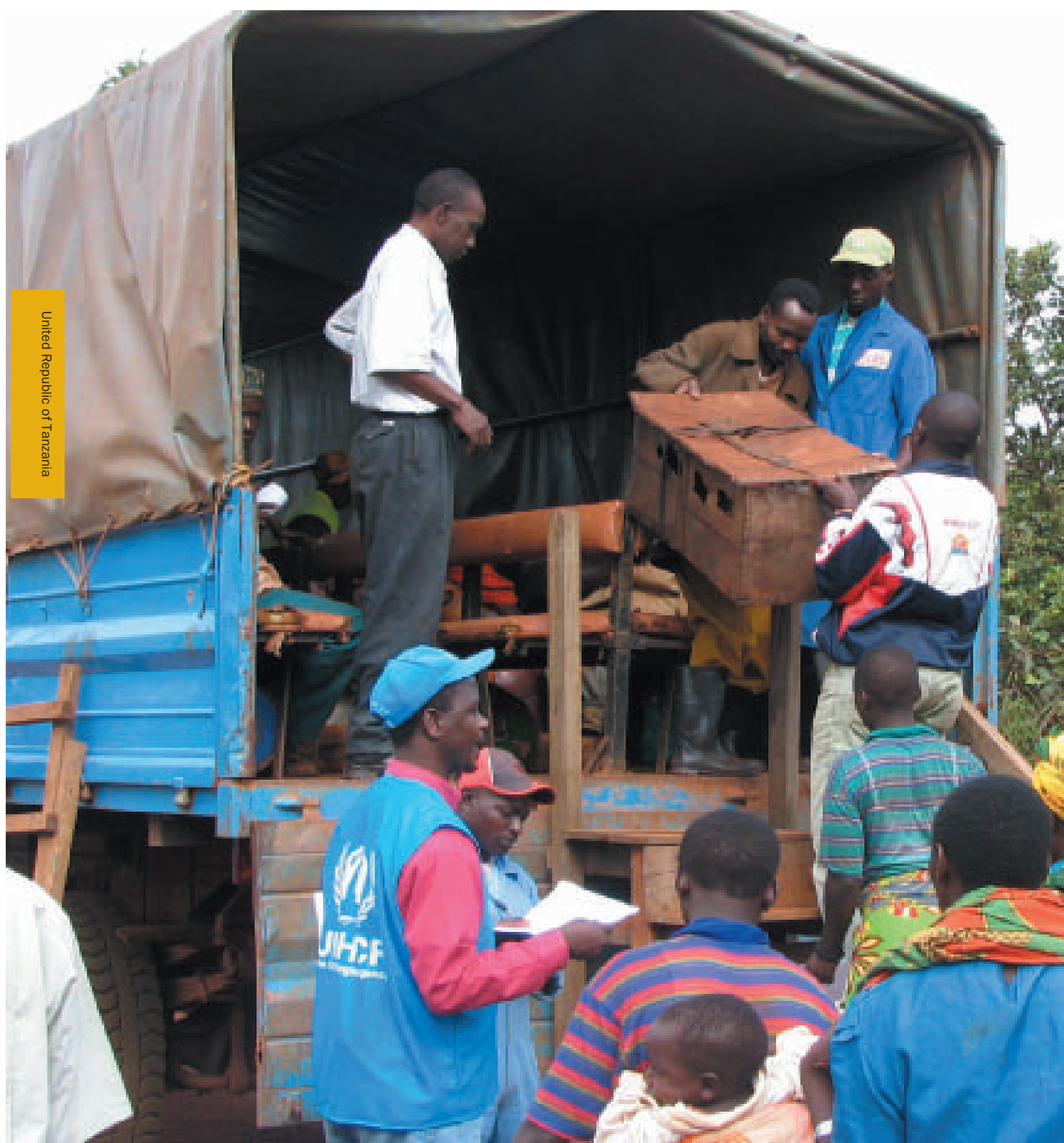
Burundian refugees at Kanembwa Departure Centre in Kibondo loading their belongings in preparation for repatriation.

In 2006, UNHCR will provide enhanced support to an estimated 200,000 "1972 Burundian refugees" (Burundians who left their country in 1972 or before the 1993 events) living in established settlements in Rukwa and Tabora Region. UNHCR will