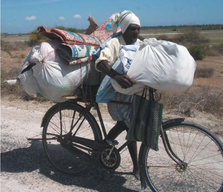
People fleeing fighting in Jaffna province try to take as many possessions as they can with them.

addition, it will update displacement figures and assessments of village infrastructure as conditions permit.