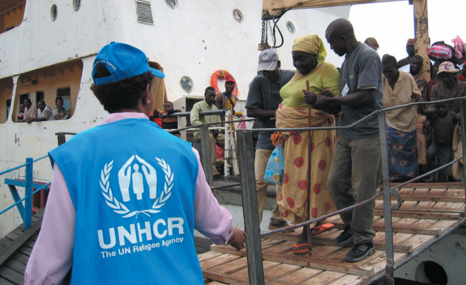
Democratic Republic of the Congo: A returnee woman is assisted to disembark the ferry in Baraka, on her way home from the United Republic of Tanzania.

In 2005, UNHCR was a key partner in the two main regional HIV/AIDS initiatives: the Great Lakes Initiative on HIV/AIDS and the Congo-Oubangui-Chari Initiative. Refugees, returnees, IDPs and host communities are expected to benefit from these funding mechanisms. In addition, HIV/AIDS programmes were implemented as part of the country operations, including, for example, public awareness campaigns in Burundi, access to voluntary counselling and testing for refugees in Rwanda, training workshops for the staff of UNHCR and its partners in the CAR, and the distribution of HIV/AIDS-awareness packages to Angolan refugees in DRC.