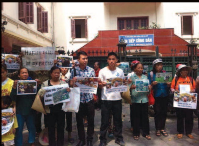
Activists protest violent assaults in Hanoi. The placards read "Strongly against villainous violence" and "Need to bring perpetrators to light", May 2015.

The report concludes by calling for a series of concrete measures to put an end to this practice. Vietnamese leaders should publicly and unambiguously condemn these attacks. The government should order the Ministry of Public Security to ensure thorough and impartial investigations of all incidents of beatings reported by bloggers and activists. At the same time, the National Assembly should repeal or amend provisions in the penal code that criminalize peaceful dissent.