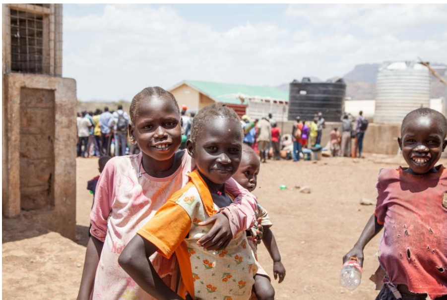
Photo: Happy new arrival South Sudanese children pose for a photo at Nadapal Transit Centre.