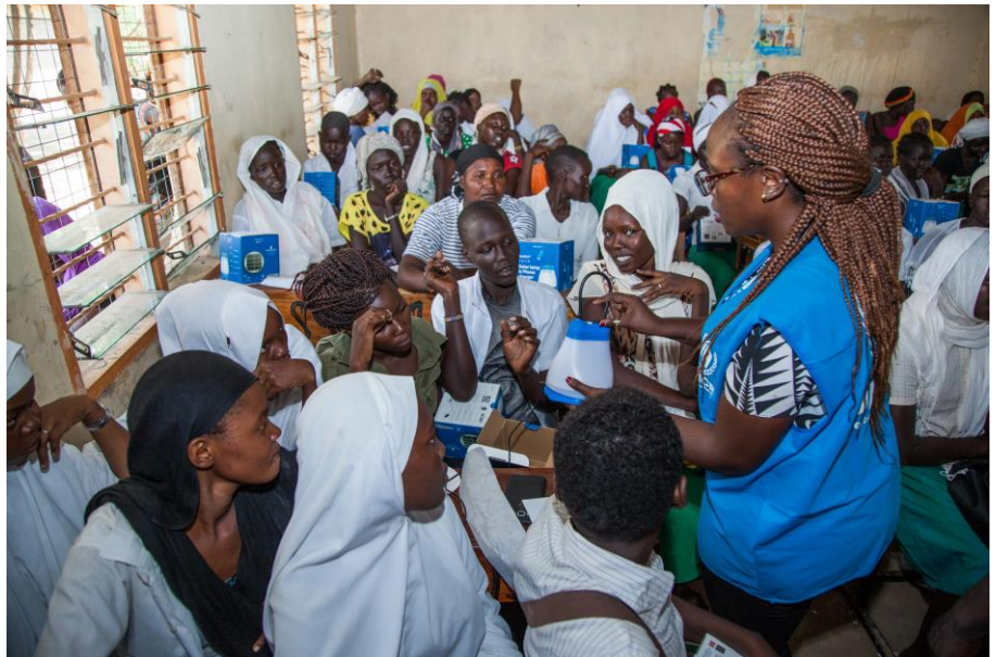
Photo: UNHCR Staff distributes solar lanterns to form one girls at Greenlight Secondary School in Kakuma refugee camp. UNHCR/ S.Otieno