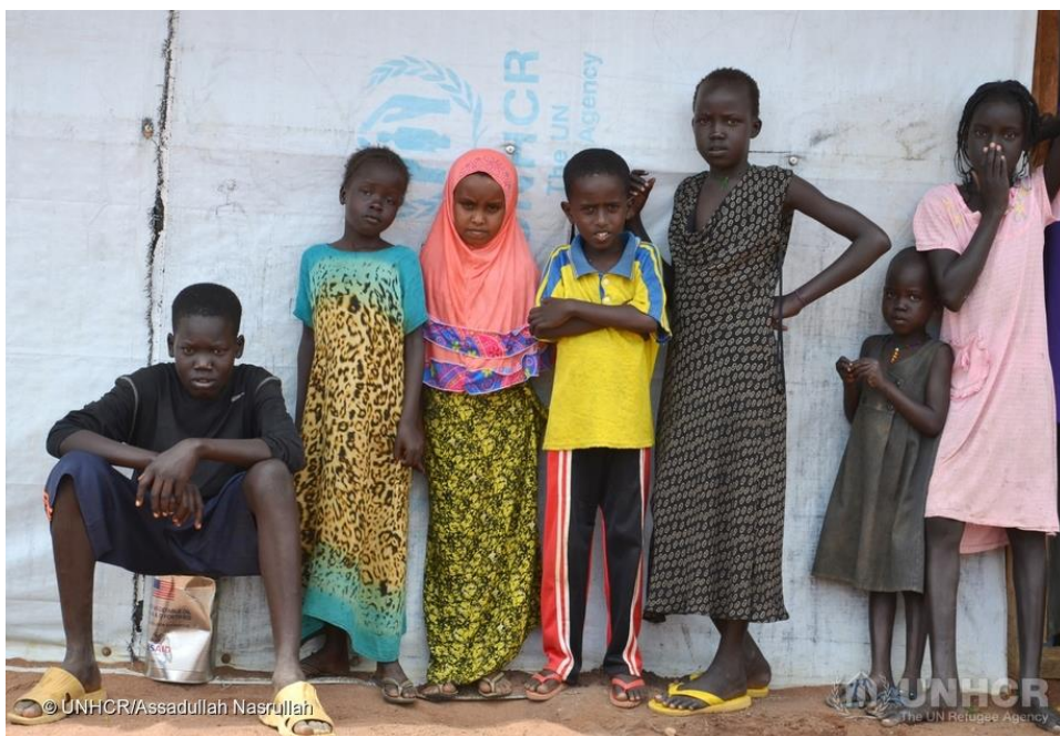
Refugee children in Dadaab camps.