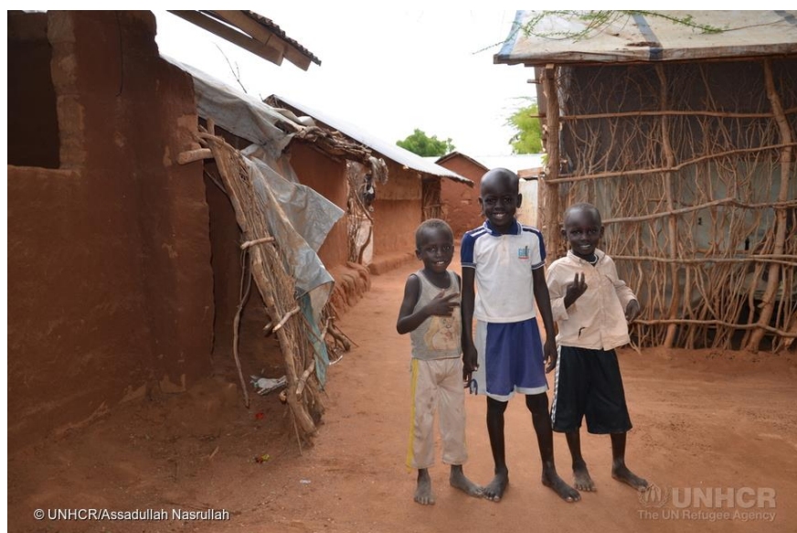
Refugee children from Ifo camp of Dadaab.