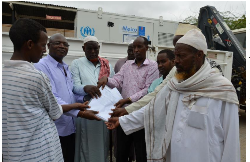
UNHCR's Dadaab Head of Operations hands over a power generator to the host community representatives.