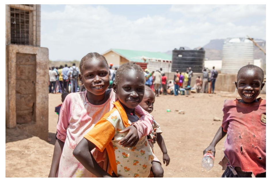
Photo: Happy new arrival South Sudanese children pose for a photo at Nadapal Transit Centre. UNHCR/S.Otieno

positively cope with challenges such as trauma, and interpersonal relationships.