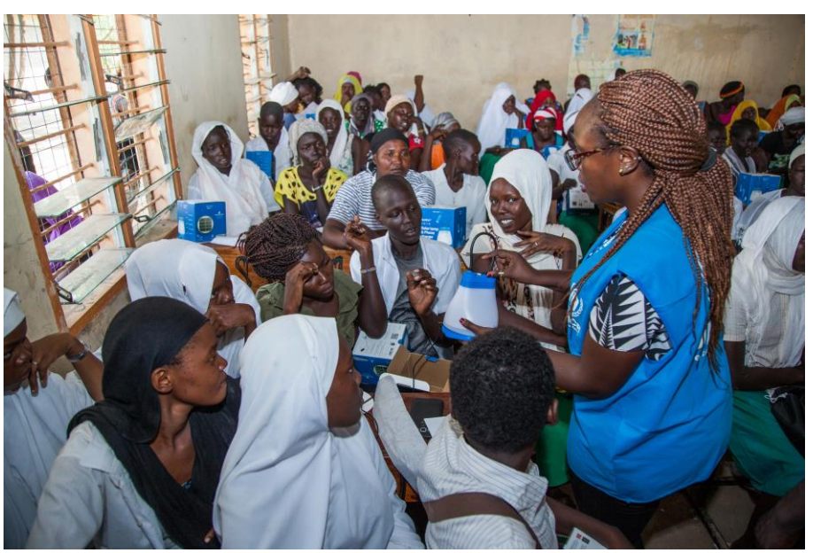
Photo: UNHCR Staff distributes solar lanterns to form one girls at Greenlight Secondary School in Kakuma refugee camp. UNHCR/ S.Otieno