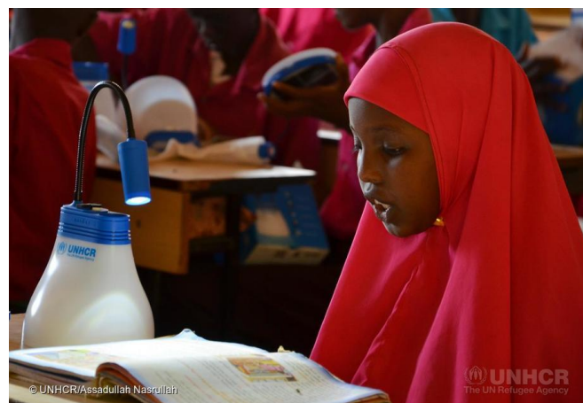
Solar lamps play an important role in the education of young people in Dadaab.