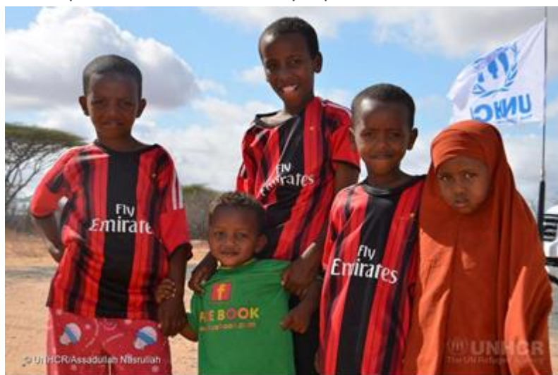
Siblings wait to board their flight to Mogadishu. Road convoys remain suspended due to heavy rains in some parts of Somalia.

UNHCR Dadaab initiated the first teleconference on the voluntary repatriation of Somali refugees from Kenya to Somalia which was organised on 12 May with the participation of Branch Office Nairobi and Sub Office Kakuma. This teleconference which will be taking place on a weekly basis is aiming at harmonizing approaches among in the three locations through sharing of good practices, synchronizing return movements, consolidating critical information and improving coordination between Kenya and Somalia in this process.