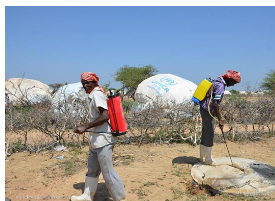
Disinfection of households and latrines is ongoing to prevent an outbreak of diseases.