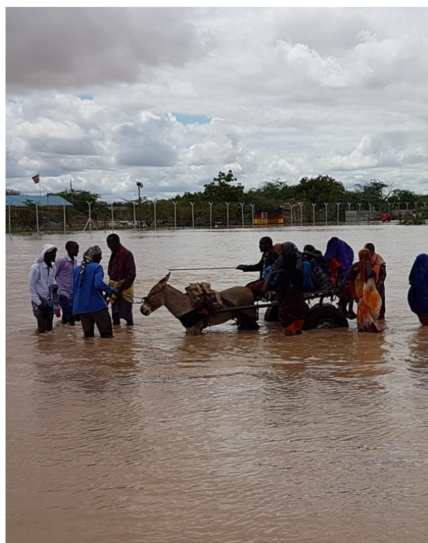
Families wade through flood waters to get to higher ground in Ifo camp.

The ration card exchange exercise was carried out successfully across all the four camps from 2nd to 10th May 2017. Out of 57,580 active households registered in UNHCR database, 53,991 (94%) households were issued with the new ration cards.