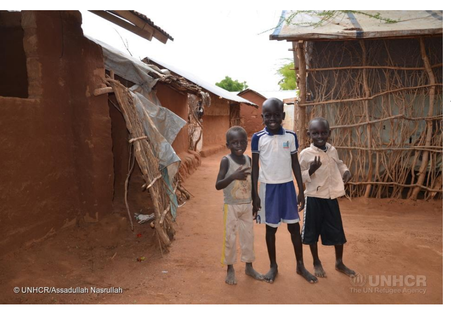
Refugee children from Ifo camp of Dadaab.