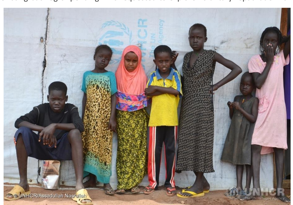
Refugee children in Dadaab camps.

Representatives of the Dadaab Inter-Agency Child Protection Working Group met on 13<sup>th</sup> April 2017 to continue efforts to disseminate the child-friendly messaging developed to address select thematic areas affecting refugee children and families in Dadaab. A representative from Film Aid shared the creative brief for them to develop radio spots, posters, and banners sharing the messages in several different languages.