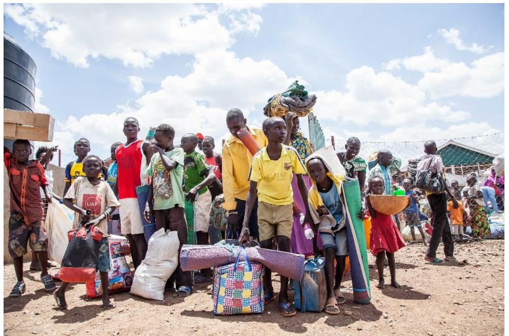
PHOTO: New arrival South Sudanese refugees at Nadapal Transit Centre prepare to board a UNHCR vehicle to Kakuma refugee camp. UNHCR/S.Otieno