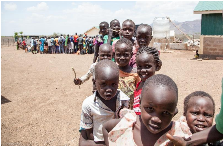
PHOTO: New arrival children pose for a photo at Nadapal transit Centre