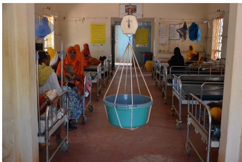
Acute malnutrition stabilization ward in Ifo camp hospital of Dadaab.