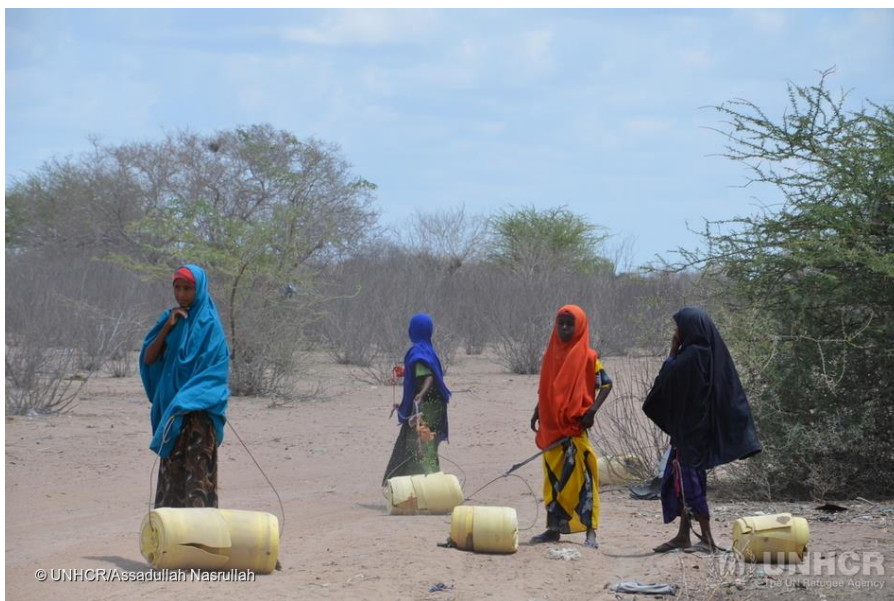
Children from the drought affected host community villages walk long distances to gather water for their families.