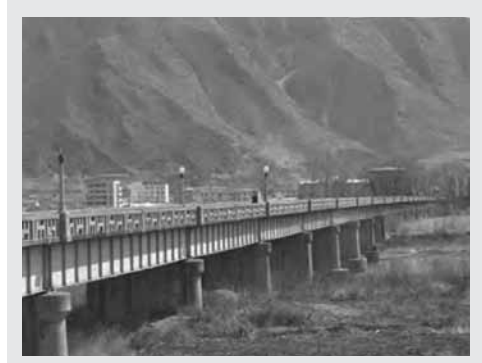
The bridge connecting Tumen in China and Namyang in North Korea, over the Tumen river.

These images are taken from Lives for sale: Personal accounts of women fleeing North Korea to China, published by the Committee for Human Rights in North Korea. Online at www.hrnk.org/uploads/pdfs/Lives_for_Sale.pdf