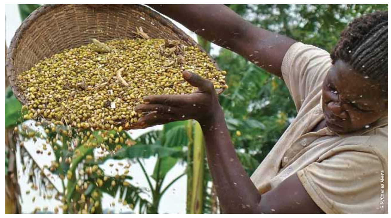
A farmer winnows her bean harvest in Nwoya district, Uganda.

Recurrences of conflict and re-displacement are becoming a common feature of the Great Lakes region. The land