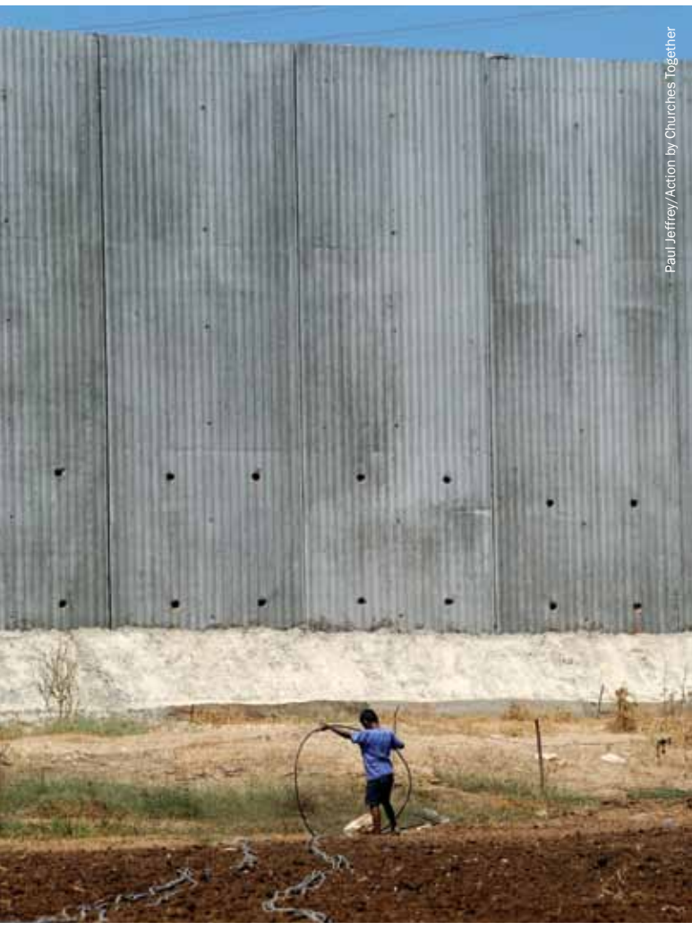
The eight-metre-high Wall (or 'separation fence') surrounds the West Bank town of Qalqilya.

difficulties faced by households who are unable or justifiably unwilling to remain in such precarious situations. The stigma associated with having relented to Israeli policies or actions can be significant.