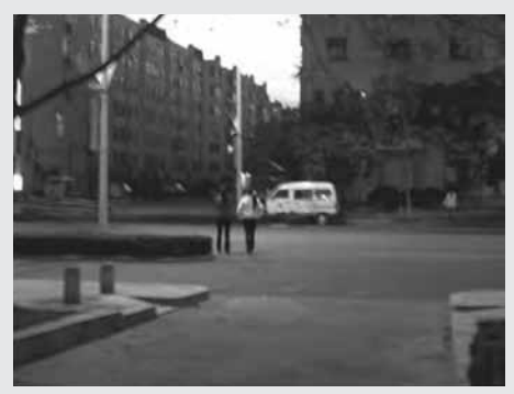
Two North Korean women working as sex workers in Qingdao leave after having interviews with a research team.