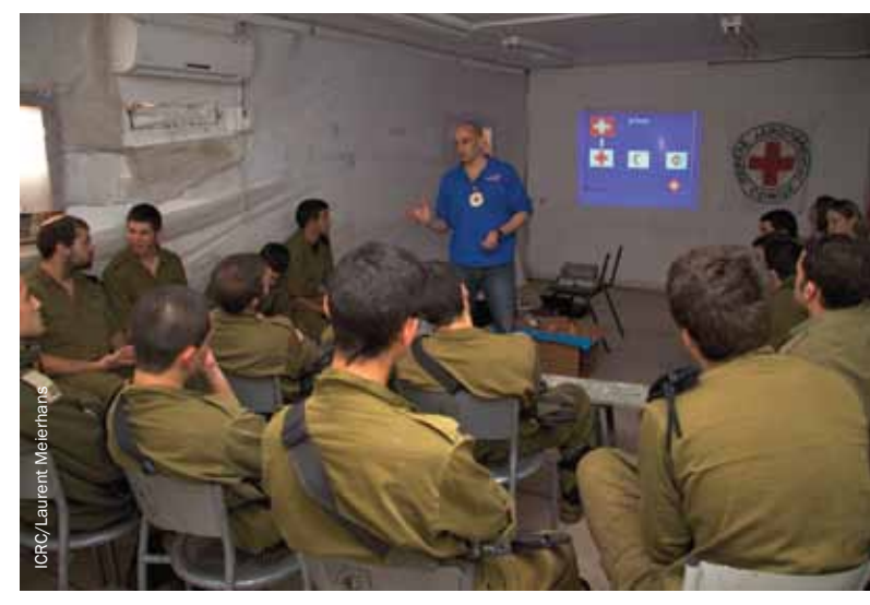
Dissemination session on international humanitarian law for the Israeli Defense Forces, in Nablus

Beyond the 'push factors' described above, an important cause of internal displacement in crises is the 'pull factor' created by the local concentration of services provided by humanitarian organisations – in places such as camps – at a level that is significantly higher than in the surrounding area. This is particularly common in underdeveloped regions, where a severe absence of economic opportunities and services characterises environments in which armed violence occurs. The basic standard of living, even of those who are not directly affected by violence, is often dismally low. Aid provided to people suffering the effects of violence in accordance with internationally accepted standards often far exceeds what is available to much of the resident population and, as a result, IDP camps typically create a significant pull factor.