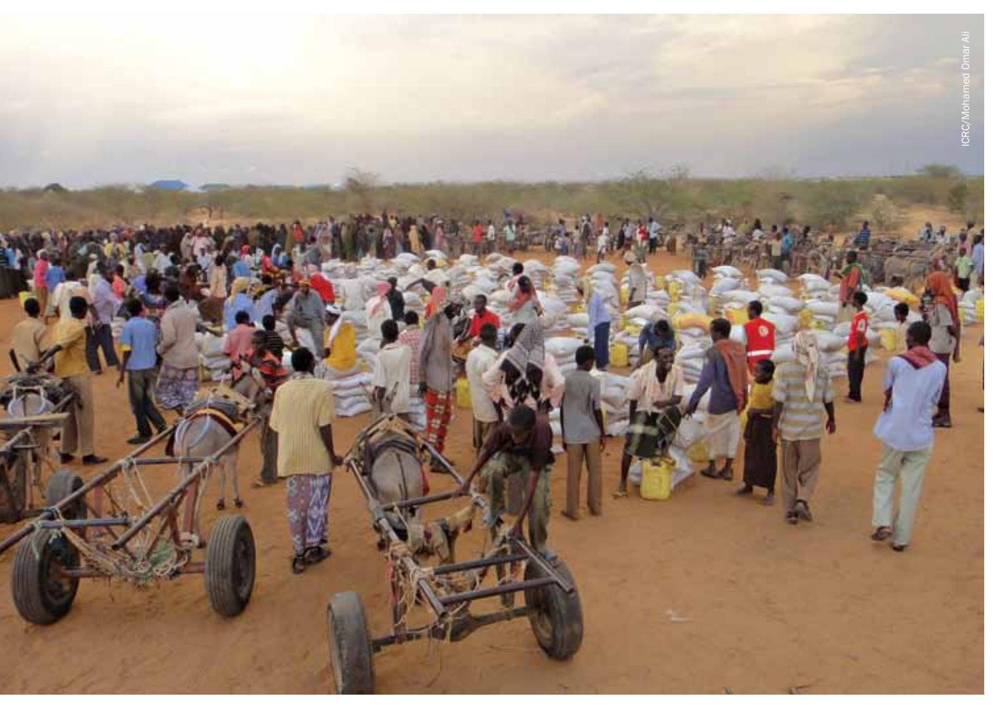
While food distributions in Somalia can help relieve immediate suffering, the ICRC also provided seed and fertilizer for 240,000 farmers ahead of the planting season to give the population the means to sustain their own livelihoods.

Humanitarian aid often aims to meet needs stemming from an immediate humanitarian crisis without meeting the needs arising from a crisis of under-development. Although this extremely complex dilemma requires solutions that stretch far beyond the humanitarian sphere, actions taken to counter the 'pull effect' of humanitarian aid - particularly IDP camps - should nevertheless be considered within the design of a project. Although humanitarian actors tend now to be more aware of the potential pull effect of their assistance, there may be security reasons, logistical challenges or political decisions that prevent their access to affected communities. Relief centres are therefore set up in more accessible areas. However, it is essential to provide assistance as close as possible to affected populations' region of origin and, if possible, to support them with relief that is flexible enough to facilitate return and restart economic activities. Restoring access to basic services such as water, electricity, schooling and medical care may also prevent long-term displacement.