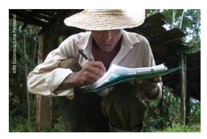
Beneficiary signs an agreement allowing him to receive materials in order to establish a cocoa and plantain productive unit, as part of a project addressed towards forced displacement prevention in Currillo, Caquetá.

The Law was the result of a national consensus among various stakeholders such as the government, Congress, political parties, human rights organisations and victims' organisations. It promotes a model that aims to break the cycle of victimisation and start a process of empowerment instead. The solutions envisioned under the law include promoting the active participation of victims in the design and implementation of the law, accompanying and assisting victims in establishing livelihoods, and supporting victim networks and initiatives. According to the law, respect for the dignity of the victims, their aspirations and stories should prevail in the process of participation – which in turn contributes to empowerment and confidence building. While the process is still