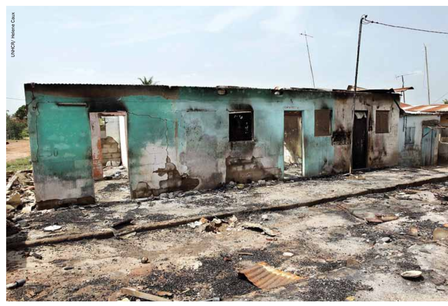
The remains of a torched house in western Côte d'Ivoire, 2011.

Another methodology to specifically prevent the repetition of forced displacement is the 'Dealing-With-the-Past Approach'. In case of a potential recurrence of forced displacement, national prevention strategies should abstain from treating IDPs separately but rather include the specific effort to prevent further forced displacement in a more general approach applicable to all victims of past human rights abuses. The Dealing-With-the-Past Approach, which brings together the rights of victims and societies and the duties of states in the field of truth, justice, reparation and guarantee of non-recurrence, is useful for states wishing to develop a national strategy to deal with past human rights abuses. Through its Task Force Dealing with the Past and Prevention of Atrocities Switzerland advises states on how to integrate the aspects of dealing with the past into their policies and strategies. It has also contributed to specific studies on the link between internal displacement and transitional justice. The Task Force will furthermore seek to strengthen the linkages and collaborations between the mandates of the Special Rapporteur on the Human Rights of IDPs and the Special Rapporteur on Truth, Justice, Reparations and Guarantees of Non-Recurrence.