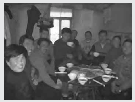
Many North Korean women live with Chinese men and sometimes become integrated into Chinese local communities.