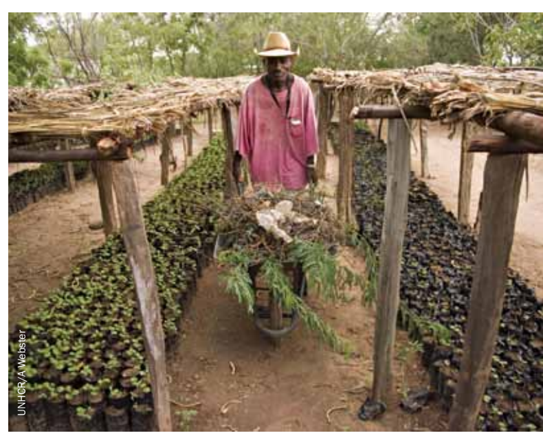
Nurseries and forestation programmes in Kakuma refugee camp, Kenya, were set up by GTZ and UNHCR to help prevent further degradation of the local environment.

A general obligation to protect the environment underlies the duty imposed on national governments to take necessary measures to prevent the occurrence of environmental risks likely to result in displacement. At the same time as governments are being forced to introduce adaptation programmes to slow down the effects of climate change and prevent displacement, the preventive principle – as well as the precautionary principle – has acquired a certain degree of authority at an international level. Numerous international laws