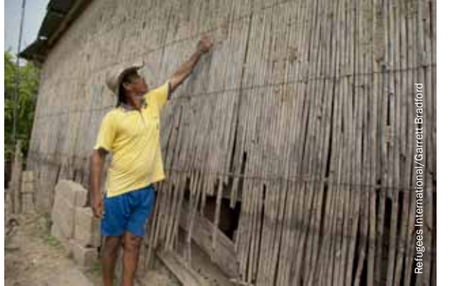
A man shows how high floodwaters reached during floods in 2011 in La Mojana region in northern Colombia.

governments to map out disaster-prone areas and to implement better zoning and land-use planning can be particularly helpful in preventing displacement by discouraging communities from building homes in identified hazard-prone areas. Such projects should in principle incorporate risk mapping and disaster planning as well. Strengthening land rights and tenure can assist and empower communities to invest in protections against displacement (such as