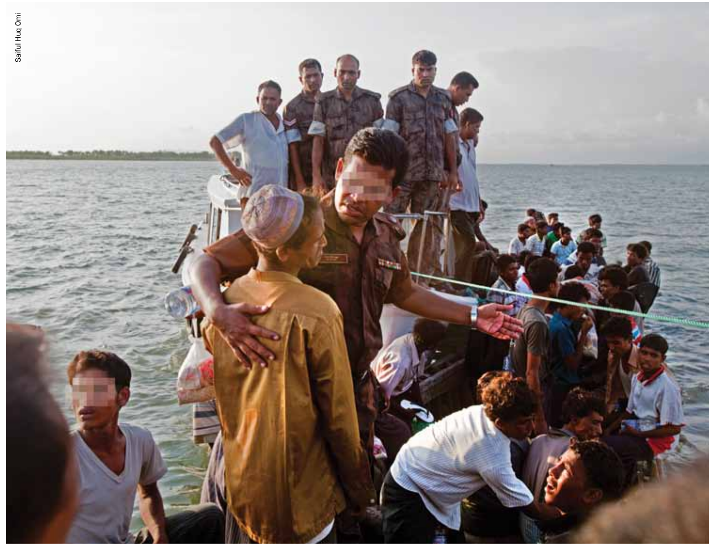
Pushback from Bangladesh, 18th June 2012

they will be either allowed or assisted to return to their home communities or to resume their lives as before.