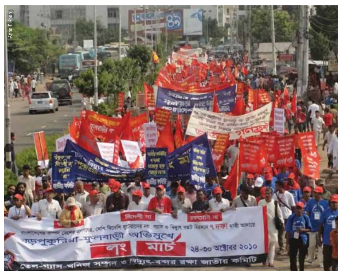
Local people against the Phulbari Coal Project on a seven-day, 250-mile protest march, October 2010.

Although 80% of all households targeted for eviction are subsistence farmers and indigenous people with land-based livelihoods, the Resettlement Plan states that their agricultural lands will not be replaced: "most households," it notes, "will become landless." The failure to provide replacement lands violates the UN Basic Principles and Guidelines on Development-based Evictions and Displacement¹ which require land-for-land compensation, and shows a reckless disregard for the large body of research showing that reliance on cash compensation alone impoverishes people who formerly had land-based livelihoods.