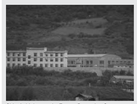
China's high-security Tumen Detention Centre where many women being sent back to North Korea are held pending their repatriation.

The reports of the UN Secretary-General and of the Special Rapporteur on human rights in North Korea as well as the resolutions of the General Assembly, adopted by more than 100 states, have called upon North Korea's neighbouring states to cease the deportation of North Koreans.<sup>7</sup>