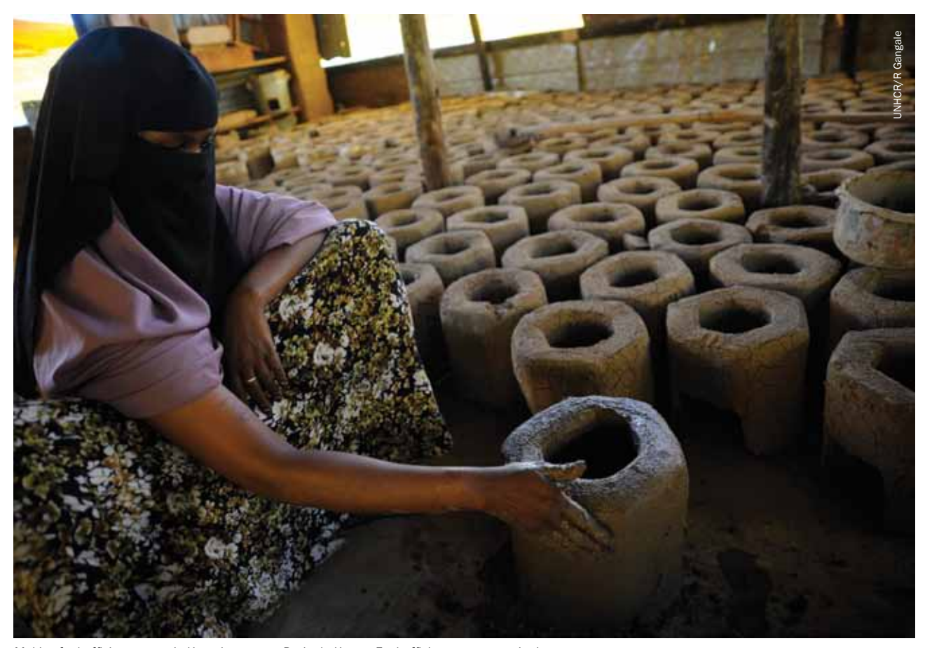
Making fuel-efficient stoves in Hagadera camp, Dadaab, Kenya. Fuel-efficient stoves require investment by assistance organisations but reduce the impact on the local environment.

Finally, while the methodology's focus is on livelihoods and micro-economic impacts and costs, assessing the impacts at the macro-economic level is an equally important dimension of the analysis. Refugees increase