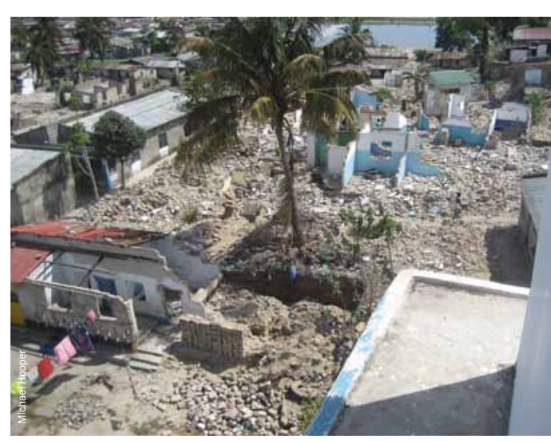
Demolished homes following evictions in Dar es Salaam's Kurasini Ward.

experience more negative outcomes with respect to employment. These evictees either had to commute long distances to jobs near their former homes or find new forms of livelihood in their new places of residence.