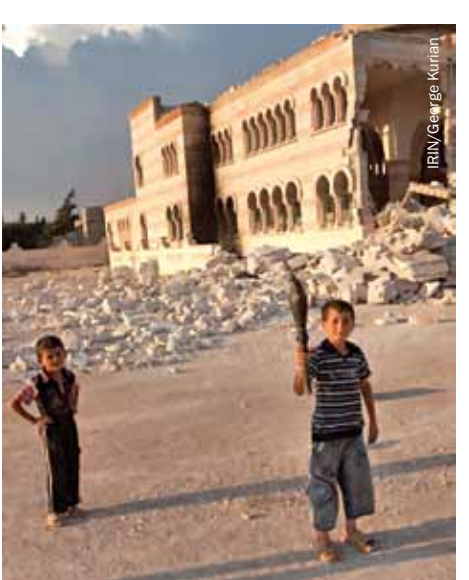
Children in Assas, Syria, playing with casings and unexploded shells, 2012.