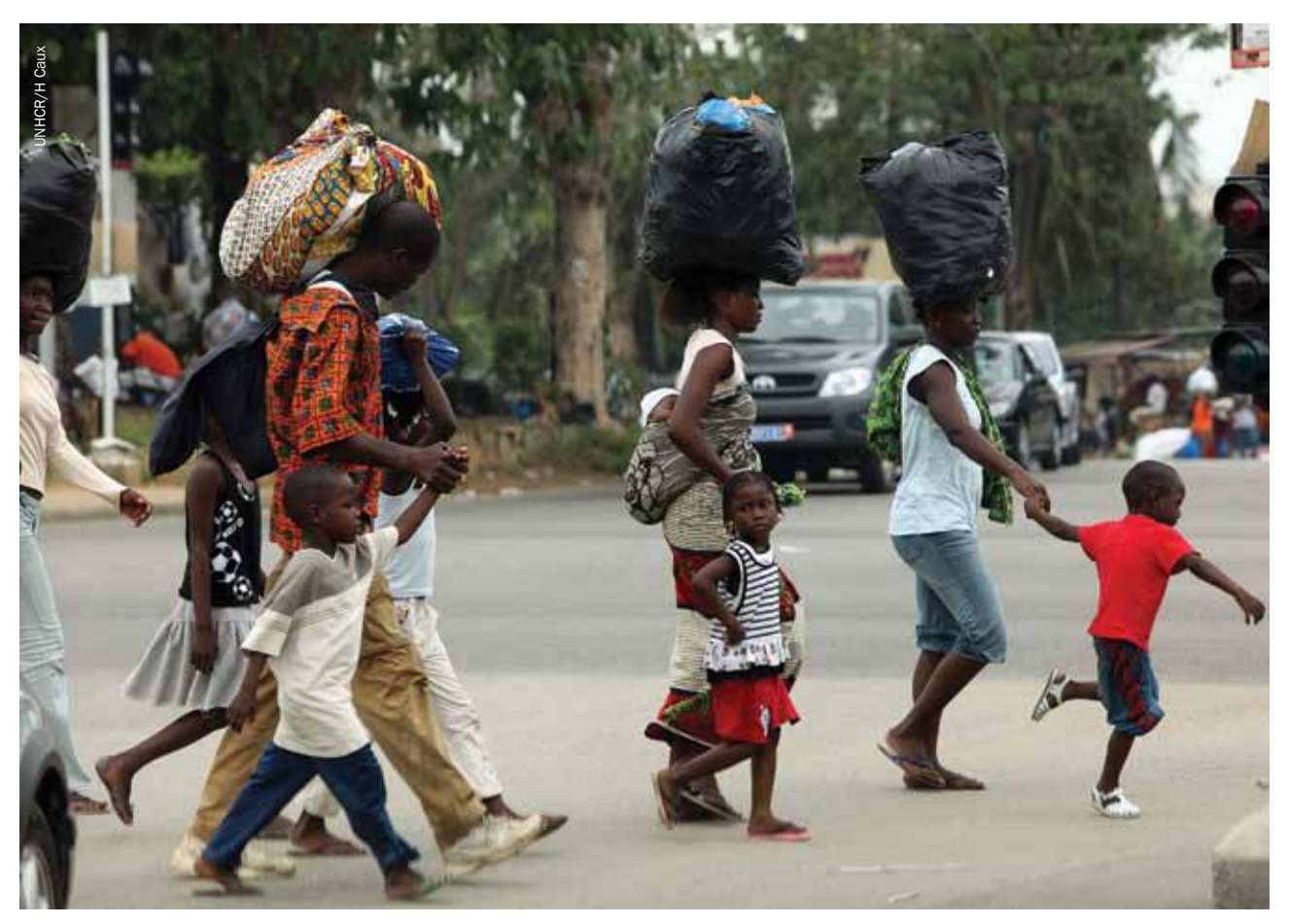
A family hurries away from the Abobo neighbourhood in search of safety during political unrest in Abidjan, Côte d'Ivoire, 2011.

right not to be displaced.<sup>3</sup> Five years later, the Special Rapporteur on Housing and Property Restitution, Paulo Sérgio Pinheiro, articulated the UN Principles on Housing and Property Restitution for Refugees and Displaced Persons (commonly known as the Pinheiro Principles). Principle 5(1) explicitly recognises the right not to be arbitrarily displaced, almost exactly copying the Guiding Principles. Although these instruments are not legally binding, they are evidence of the widespread acceptance of Principles 5 to 9.