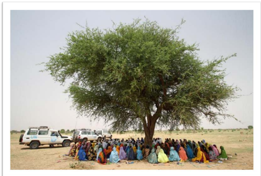
A meeting with returnees in Borota, eastern Chad. The key concern discussed was the lack of clean water.