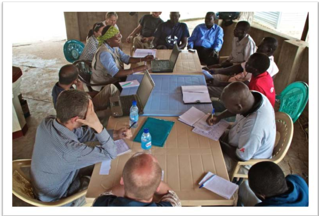
Coordination meeting at Agok in Warrap state, South Sudan. Thousands of residents of Abyei settled in Agok after being displaced by armed clashes in 2011.

The terms of reference of sub-national clusters should follow the core functions of the cluster at the country-level, while at the same time being streamlined and tailored to local operational realities. Accordingly, the working methods of sub-national clusters must be light and focused on service delivery and operational activities; ensuring reporting and information sharing with the national cluster and, through that mechanism, other sub-national clusters; and promoting the involvement of the affected populations in cluster activities to ensure that humanitarian actors respond adequately to their actual needs.