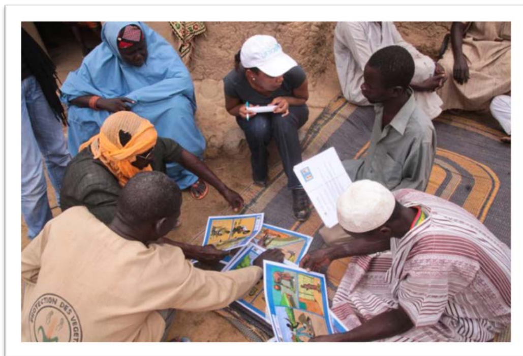
Aid workers conducting cholera awareness campaigns to at-risk communities in Niger. In 2012, nearly 4,000 cholera cases and over 80 deaths have been reported, mostly along the Niger River which recently flooded after heavy rains in the west of the country.

Finally, each cluster is also responsible for integrating early recovery from the outset of the humanitarian response. The RC/HC has the lead responsibility for ensuring early recovery issues are adequately addressed at country level, with the support of an Early Recovery Advisor. The Advisor works on inter-cluster early recovery issues for a more effective mainstreaming of early recovery across the clusters and to ensure that multidisciplinary issues, which cannot be tackled by individual clusters alone, are addressed through an Early Recovery Network 13 . Exceptionally, where early recovery areas are not covered by existing clusters or alternative mechanisms, the RC/HC may recommend a cluster be established in addition to the network to address those specific areas.