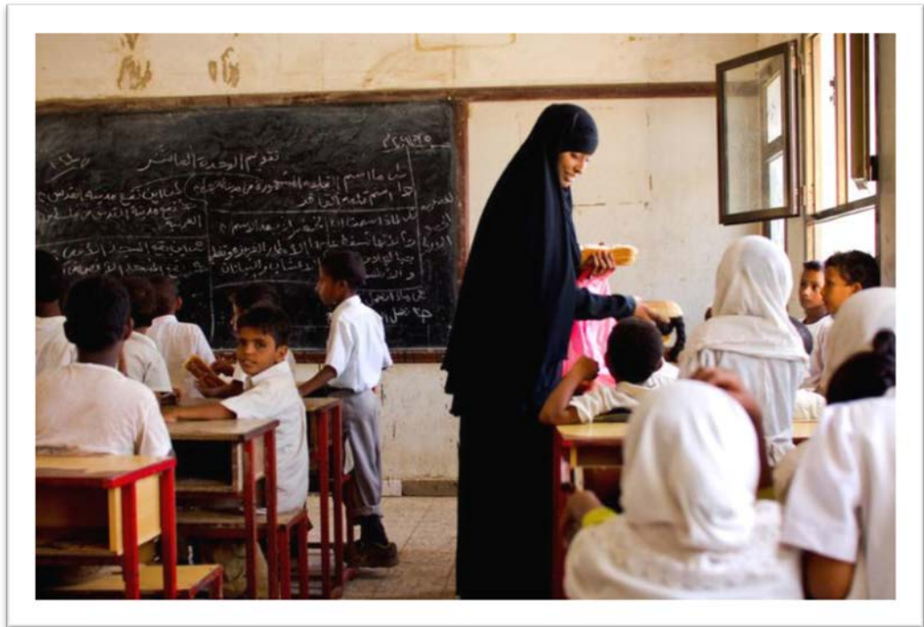
Yemeni girls stay at home to work when food is limited. With one of the greatest gender disparities in the world, school feeding programmes strive to encourage rural families to enrol their young daughters in basic and secondary education.

To facilitate communication with specific groups within the broader membership or outside of the cluster - such as experts in particular technical areas (including cross-cutting issues), military actors, government counterparts, and UN senior leadership - the SAG might also designate cluster partners to serve as a liaisons with these groups.