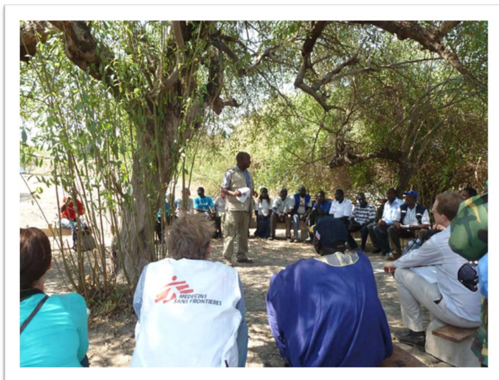
Humanitarian workers at a coordination meeting in South Sudan's Pibor coordination hub, Jonglei State, where inter-communal violence affected nearly 170,000 people. Aid organizations have recorded 165 violent incidents with humanitarian consequences in the first five months of 2012 alone.