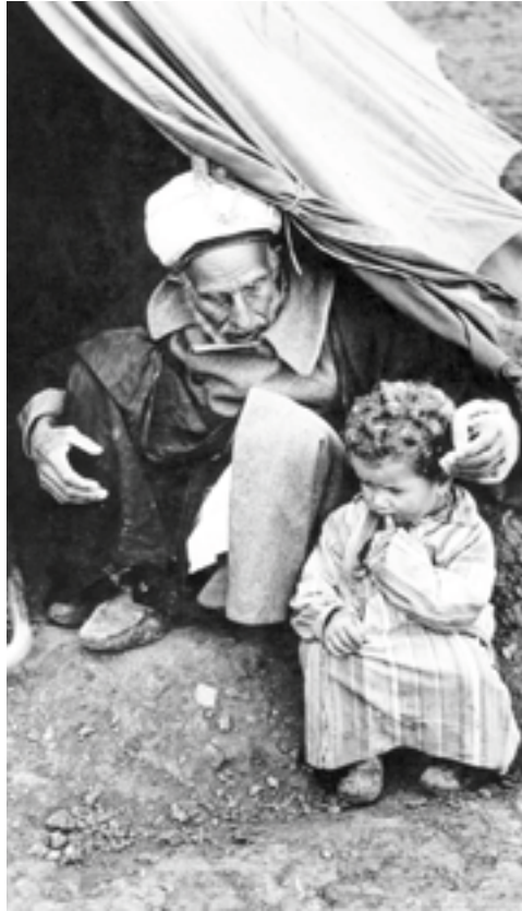
UNRWA / 1950s

UNRWA was mandated to carry out “relief and works programmes” in support