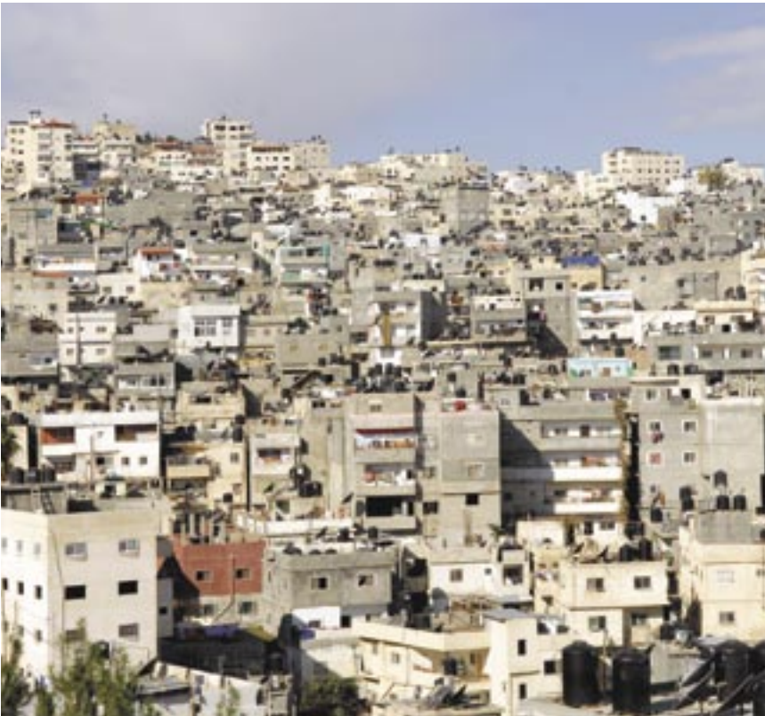
UNRWA / 2006

Only one-third of the registered refugees still live in refugee camps. Most of the other two-thirds live in cities, towns and villages throughout UNRWA's area of operations, and some have moved outside the area and are living in other countries. UNRWA services are available to all registered refugees present in its area of operations whether they live in camps or not.