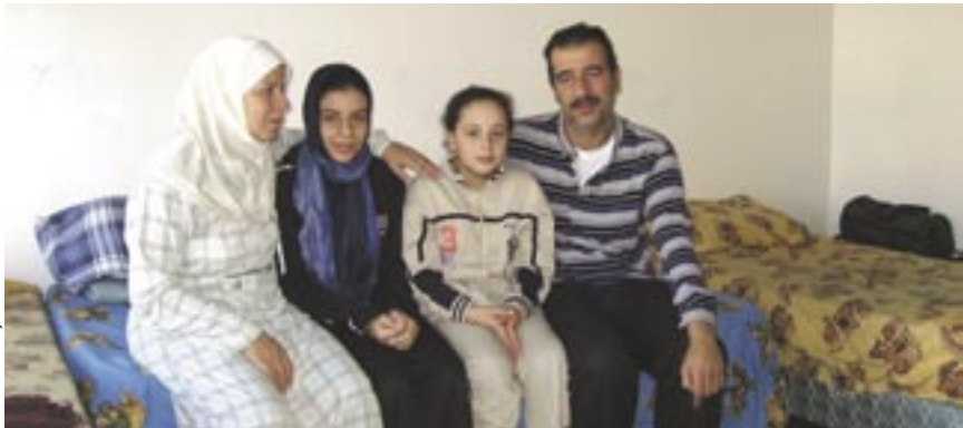
UNHCR / January 2007

A third group of Palestinian refugees consists of individuals who are neither “Palestine refugees” nor “displaced persons” but who, owing