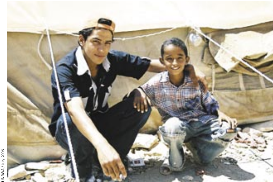
Al-Tanf tented site on the Syria – Iraq border

Most recently, UNHCR has been providing assistance to Palestinian refugees in Iraq as well as, in coordination with UNRWA, to those who fled to Jordan and Syria, and is actively searching for solutions to their plight. It is also providing individual assistance to some destitute Palestinians in Egypt and Libya.