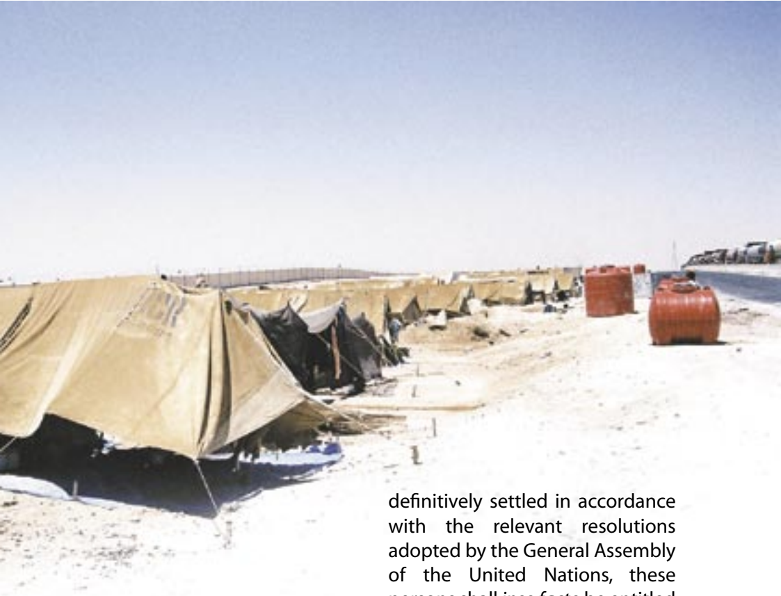
Al-Tanf tented site on the Syria – Iraq border

Article 1D of the 1951 Convention states that the Convention “shall not apply to persons who are at present receiving from organs or agencies of the United Nations other than the United Nations High Commissioner for Refugees protection or assistance. When such protection or assistance has ceased for any reason, without the position of such persons being