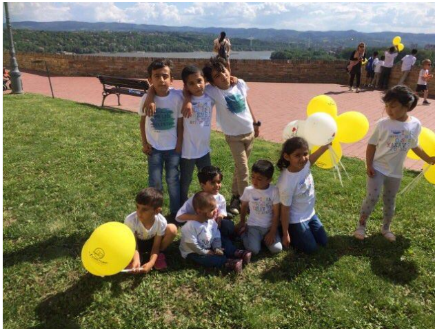
Refugee children from Krnjaca AC participated in Baby Exit Festival, Novi Sad (Serbia), ©UNHCR, 27 May 2017

Majority of the residents of Presevo RC are from Afghanistan (56%) and Iraq (29%), and 48% are children. In Bujanovac, which continues to accommodate only families with children and UASCs, majority are from Iraq (48%) and from Syria (29 %), while 60% are children.