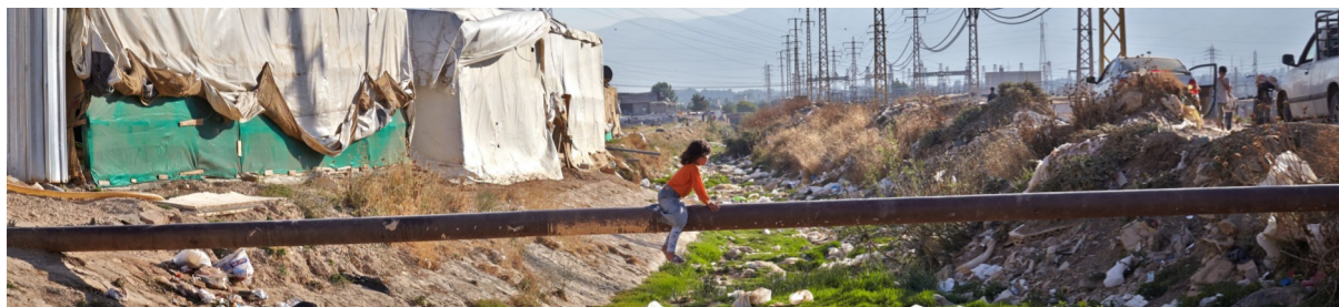
A young Syrian refugee girl slowly makes her way across a pipe over a pile of rubbish in an informal settlement outside of Zahle, Lebanon.

Preparedness and response planning for Acute Water Diarrhea (AWD) outbreak risk is ongoing with drafting of a Health and WASH Plan and organizing of training for NGO and Government WASH and Health professionals in the different field areas.