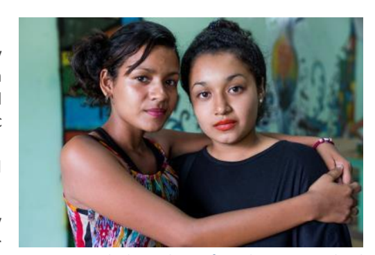
Teenage girls have been forced to quit school because of threats by gang members in San Pedro Sula, Honduras.

• In the past two years deportation figures from the United States and Mexico have doubled. Despite UNHCR's efforts, in coordination with the Government and NGOs, to establish guidelines for the identification of persons with protection needs upon arrival, the absence of sufficient and effective protection mechanisms remains a major problem. Secondary movements within national boundaries increase the difficulty to monitor the situation and identify effective protection alternatives.