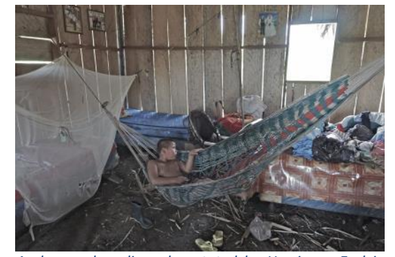
Asylum-seekers lives devastated by Hurricane Earl in Belize. From his hammock, six-year-old Edgar gazes out of the window of his family's thatched-roof hut at the mess left behind by the hurricane.

On 14 July the Refugee Eligibility Committee (REC) met to discuss the application of the 14-day deadline within which asylum-seekers need to submit their asylum application upon arrival in the country in order to be admitted to the RSD procedure. This provision is contained in Article 8 of the 1991 Belize Refugee Act (revised in 2000), but it had so far not been strictly enforced. The REC expressed concern about the intention of the Government to apply this deadline systematically, irrespective of the particular circumstances of each case, and as a bar to the asylum system. The REC submitted a memorandum requesting the Government to clarify its position with respect to the 14-day deadline and assess the implications of it. The REC will only resume the review of asylum claims, once the issue surrounding the application of the 14-day deadline is resolved. In the meantime, the Head of the Refugee Department acknowledged that a reform of the Refugee Act would be required in the medium/long term.