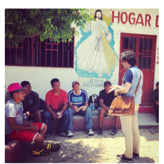
UNHCR staff in Mexico provide information and advice to people fleeing violence in Central America. UNHCR also provides food and mattresses at this shelter for people on the move in Southern Mexico.

also reached with the Defensoría Pública in Villahermosa to support appeals by asylum-seekers in Tabasco State. Overall, up to August 2016, 797 asylum seekers benefitted from legal aid.