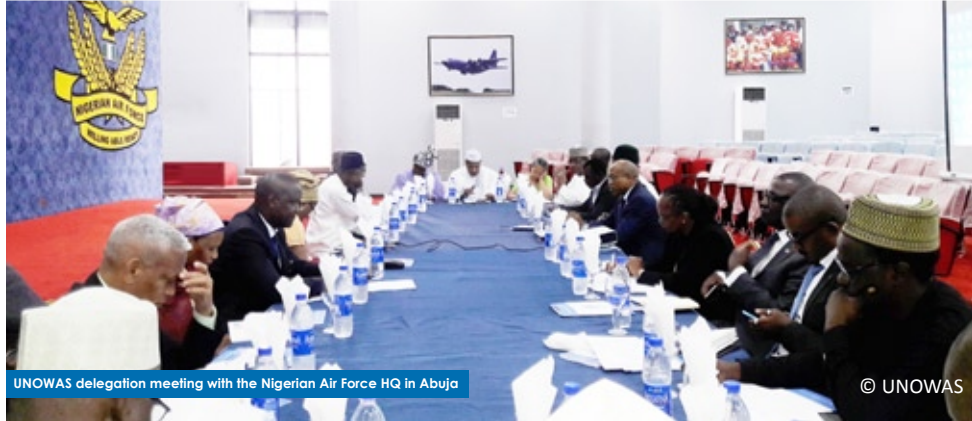
UNOWAS delegation meeting with the Nigerian Air Force HQ in Abuja

Since 2009, when the erstwhile leader of Boko Haram Mohammed Yusuf died in police custody, the level of killings and destruction, enslavement of girls and women, and the loss of livelihoods inflicted by the group has caught the world’s attention. In response, the United Nations has adopted an approach that attempts to bring together the organization’s vast experience... Read more P.3