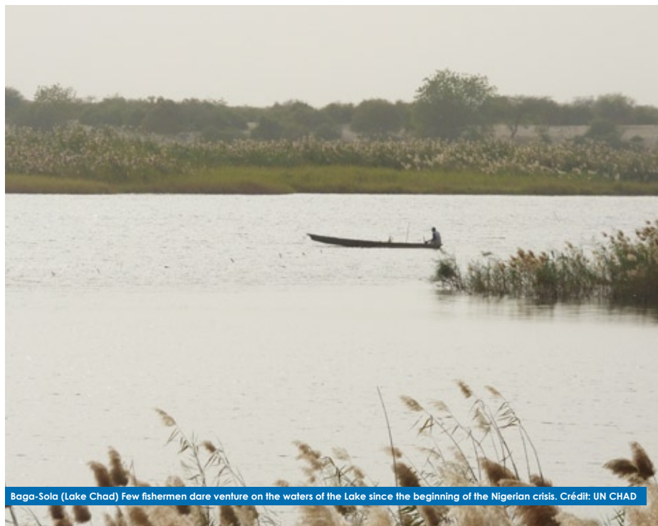
Bagu-Sola (Lake Chad) Few fishermen dare venture on the waters of the Lake since the beginning of the Nigerian crisis.