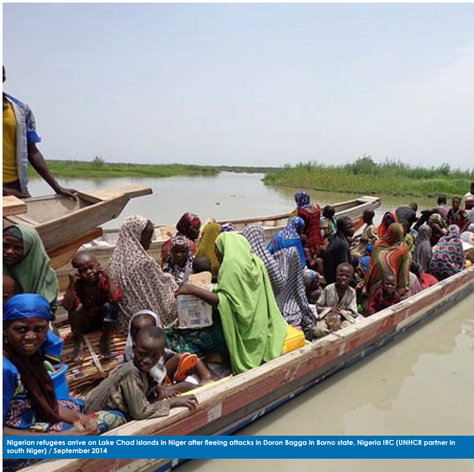
Nigerian refugees arrive on Lake Chad islands in Niger after fleeing attacks in Doron Bagga in Borno state, Nigeria IRC (UNHCR partner in south Niger) / September 2014

West Africa and the Sahel regions figured prominently in the discussions during the 71 st session of the General Assembly, which opened on 19 September 2016 at the United Nations headquarters.