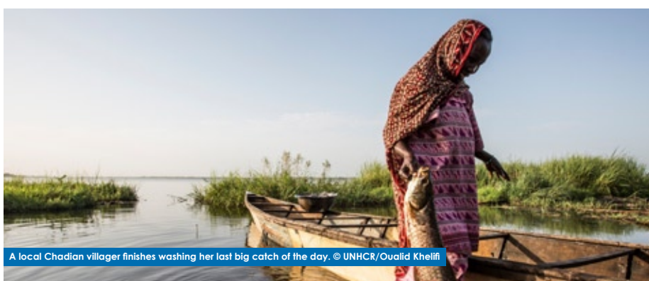
A local Chadian villager finishes washing her last big catch of the day.