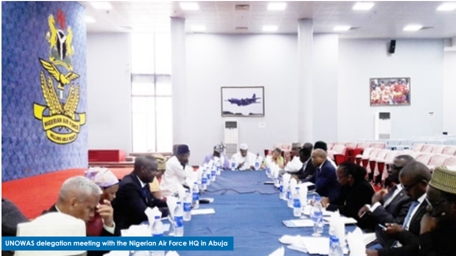
UNOWAS delegation meeting with the Nigerian Air Force HQ in Abuja

Since 2009, when the erstwhile leader of Boko Haram Mohammed Yusuf died in police custody, the level of killings and destruction, enslavement of girls and women, and the loss of livelihoods inflicted by the group has caught the world's attention. In response, the United Nations has adopted an approach that attempts to bring together the organization's vast experience, organizational capacity, and political leverage to address the multi-faceted challenges in a remote terrain stretching across national boundaries and touching upon sensitive interests. Secretary-General Ban Ki Moon himself has twice visited the region, to drum up and coordinate support for the affected populations in Nigeria and neighboring countries.