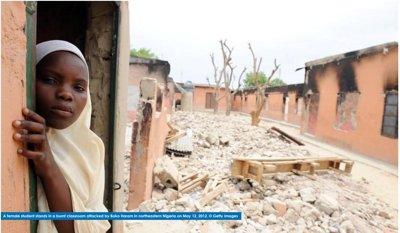
A female student stands in a burnt classroom attacked by Boko Haram in northeastern Nigeria on May 12, 2012.

The fight against terrorism is necessary, but the respect of human rights principles must be a permanent exigency for States as they are also guarantors of their citizens' freedoms.