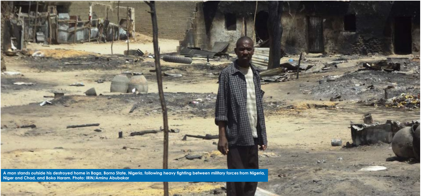
A man stands outside his destroyed home in Baga, Borno State, Nigeria, following heavy fighting between military forces from Nigeria, Niger and Chad, and Boko Haram.