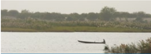
Baga-Sola (Lake Chad) Few fishermen dare venture on the waters of the Lake since the beginning of the Nigerian crisis.

As part of his joint visit in Chad with President Buyoya, Head of the African Union Mission for Mali and the Sahel (MISAHEL)... Read more P.4