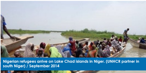
Nigerian refugees arrive on Lake Chad islands in Niger. (UNHCR partner in south Niger) / September 2014

West Africa and the Sahel regions figured prominently in the discussions during the 71 st session of the General Assembly, which opened on 19 September 2016.. Read more P.5