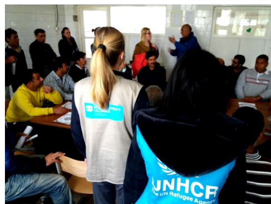
Workshop on domestic violence, Preševo RC (Serbia), @UNHCR, 6 April 2017