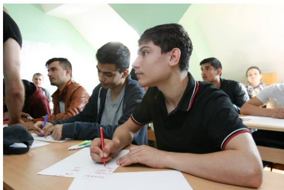
Refugee and migrant children and youths from Krnjača AC, learning English and Serbian at UNICEF-supported 'Branko Pesic' Primary School, @UNICEF/UN058500/Vas