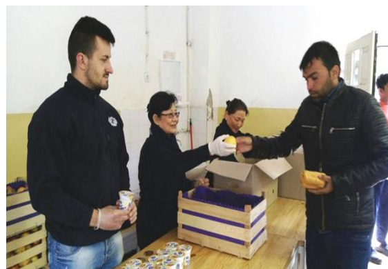
Breakfast distribution in Obrenovac TC, Belgrade (Serbia), @Tzi Chi, April 2017