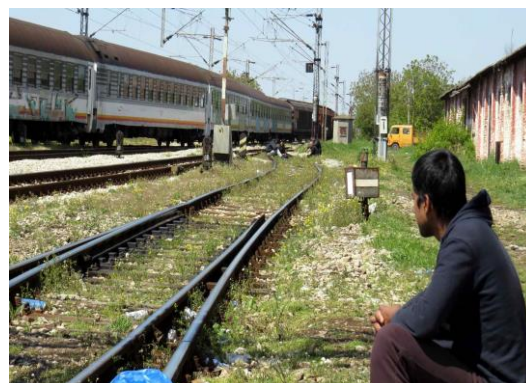
Unaccompanied minor watching the trains, Šid (Serbia), @UNHCR, April 2017