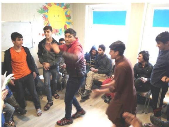
Afghan traditional dance, Adaševci TC (Serbia), @UNHCR, April 2017