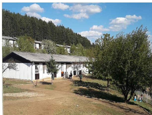
Pirot Reception Centre, Eastern Serbia, April 2017