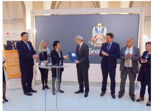
The official handover of three donated vehicles for the Belgrade's public institutions @UNDP, April 19, 2017