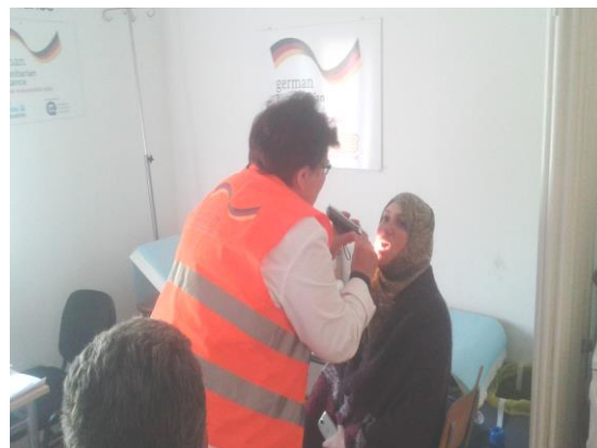
IDC medical team in Subotica TC (Serbia), April 2017