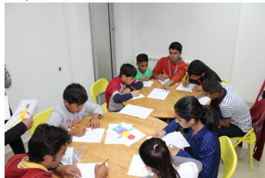
Educational workshop organized by RAS in Savamala, Belgrade (Serbia), @RAS, April 2017