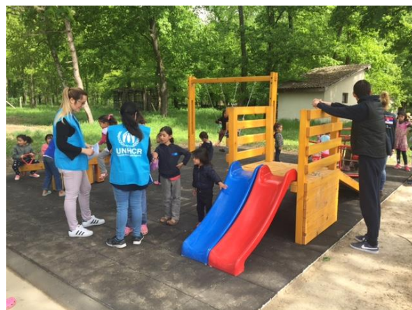
Playground in Sombor TC (Serbia), @UNHCR, April 2017