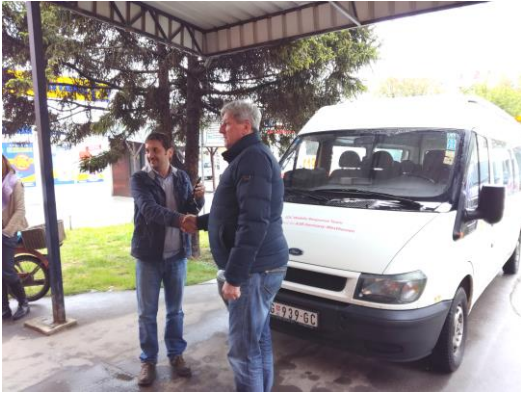
IDC handover of medical vehicle donated to Šid Health Centre (Serbia), April 2017

premises for children from the local community and migrant population. The reconstruction is part of UNDP activities that aim to strengthen social cohesion and bring closer the host and the displaced population.