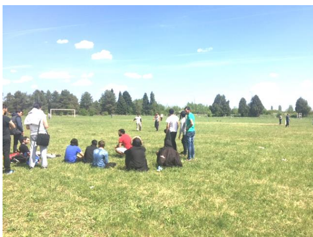
Cricket match in Obrenovac TC, Belgrade (Serbia), @UNHCR, April 2017