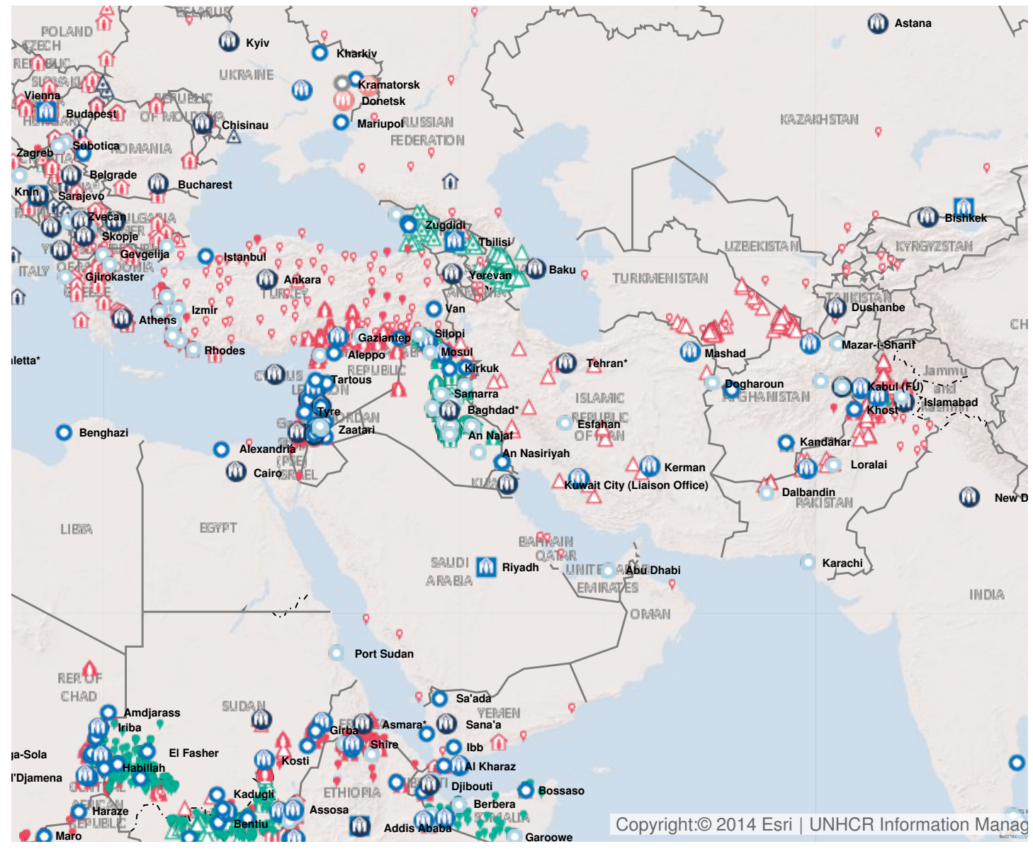
Latest update of camps and office locations 21 Nov 2016. By clicking on the icons on the map, additional information is displayed.

| Bahrain | Iraq | Israel | Jordan |Kuwait | Lebanon | Omar | Qatar | Saudi Arabia| Syrian Arab Republic | United Arab Emirates | Yemen |