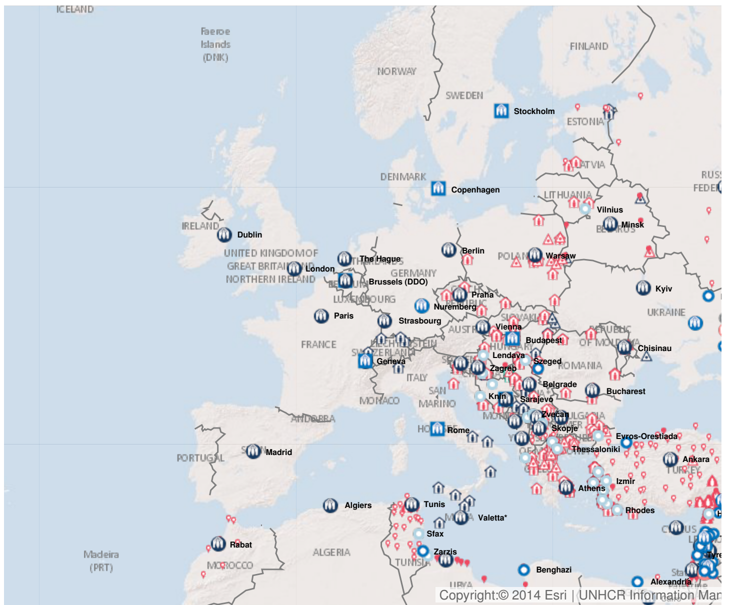
Latest update of camps and office locations 21 Nov 2016.

| Albania | Andorra | Austria | Belgium | Bulgaria | Croatia | Cyprus | Czech Republic | Denmark | Estonia | Finland | France | Germany | Greece | Holy See (the) | Hungary | Iceland| Ireland | Italy | Latvia | Liechtenstein | Lithuania | Luxembourg | Malta | Monaco |Netherlands (the) | Norway |Poland | Portugal | Romania |San Marino | Slovakia | Slovenia | Spain | Sweden | Switzerland | United Kingdom of Great Britain and Northern Ireland (the) |