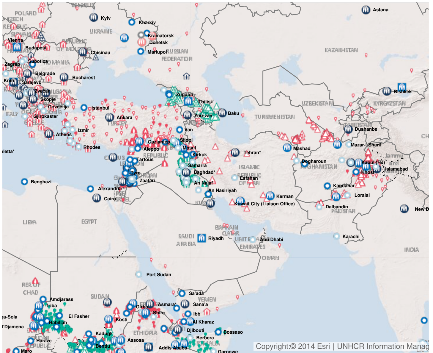
Latest update of camps and office locations 21 Nov 2016. By clicking on the icons on the map, additional information is displayed.

| Bahrain | Iraq | Israel | Jordan | Kuwait | Lebanon | Omar | Qatar | Saudi Arabia | Syrian Arab Republic | United Arab Emirates | Yemen |