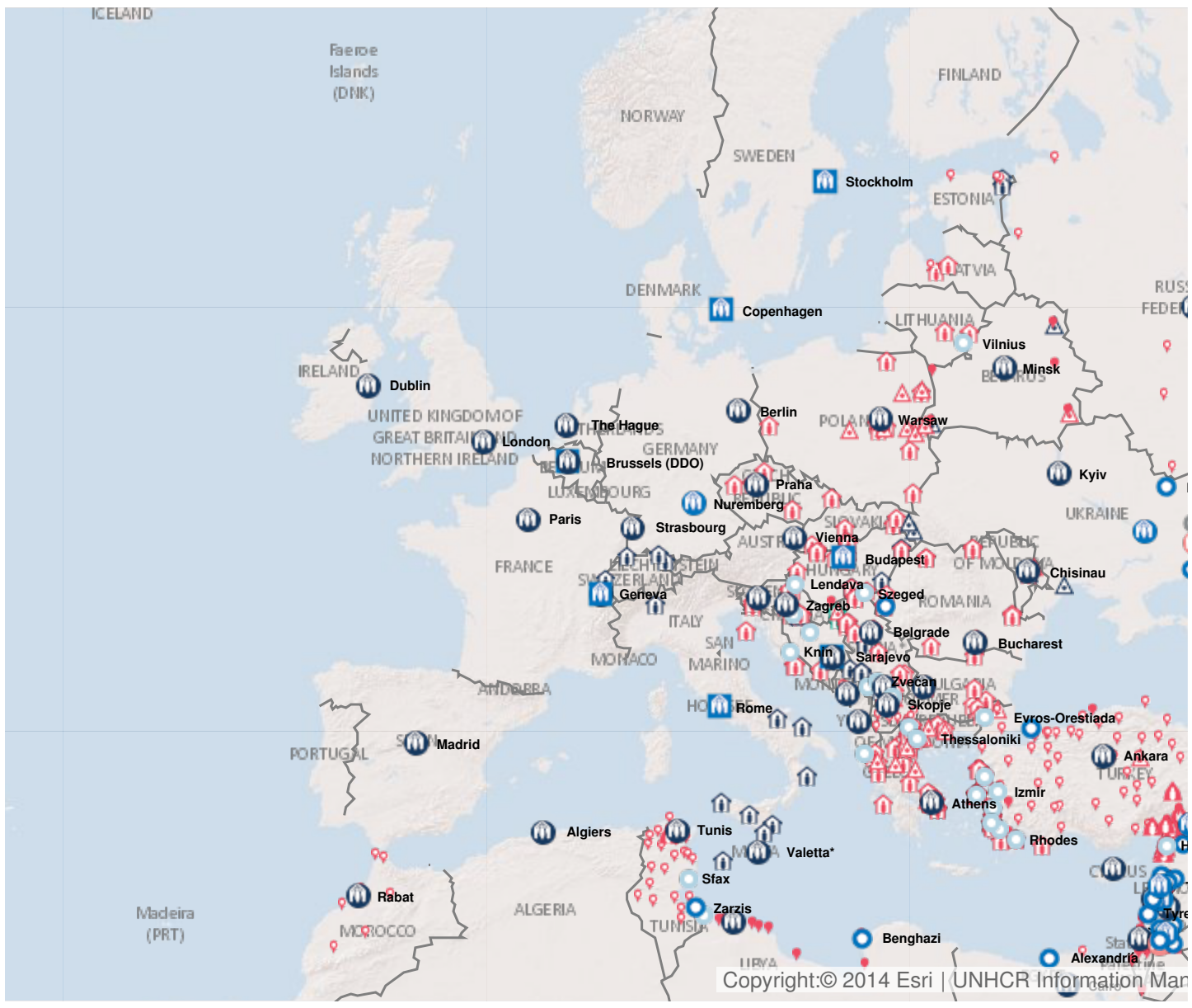
Latest update of camps and office locations 21 Nov 2016.

| Albania | Andorra | Austria | Belgium | Bulgaria | Croatia | Cyprus | Czech Republic | Denmark | Estonia | Finland | France | Germany | Greece | Holy See (the) | Hungary | Iceland| Ireland | Italy | Latvia | Liechtenstein | Lithuania | Luxembourg | Malta | Monaco |Netherlands (the) | Norway |Poland | Portugal | Romania |San Marino | Slovakia | Slovenia | Spain | Sweden | Switzerland | United Kingdom of Great Britain and Northern Ireland (the) |