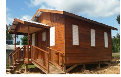
Photo: Health Resource Center in Armenia Community, provide by UNHCR in joint project with the Ministry of Health.

Assist asylum seekers to pay for medical expenses not covered by public hospitals. Cash assistance is given to the most vulnerable individuals to pay for prescription drugs, x-rays, ultrasounds and overnight hospital stays, among other services. Approximately 170 vulnerable individuals were assisted in 2016.