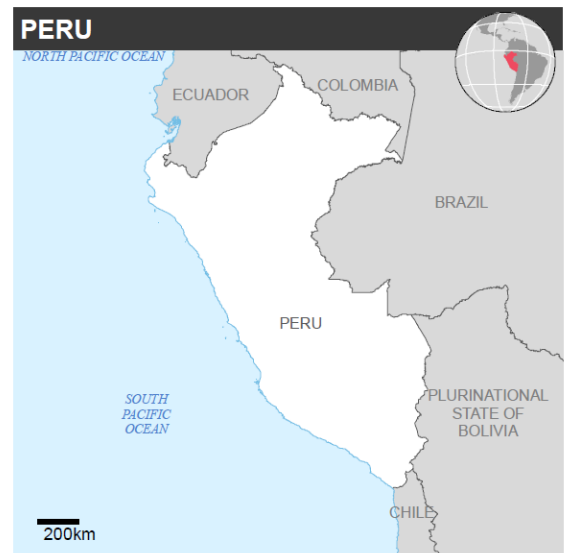
Map Sources: UNCS, UNHCR The boundaries and names shown and the designations used on this map do not imply official endorsement or acceptance by the United Nations. Printing date: 27 Sep 2016