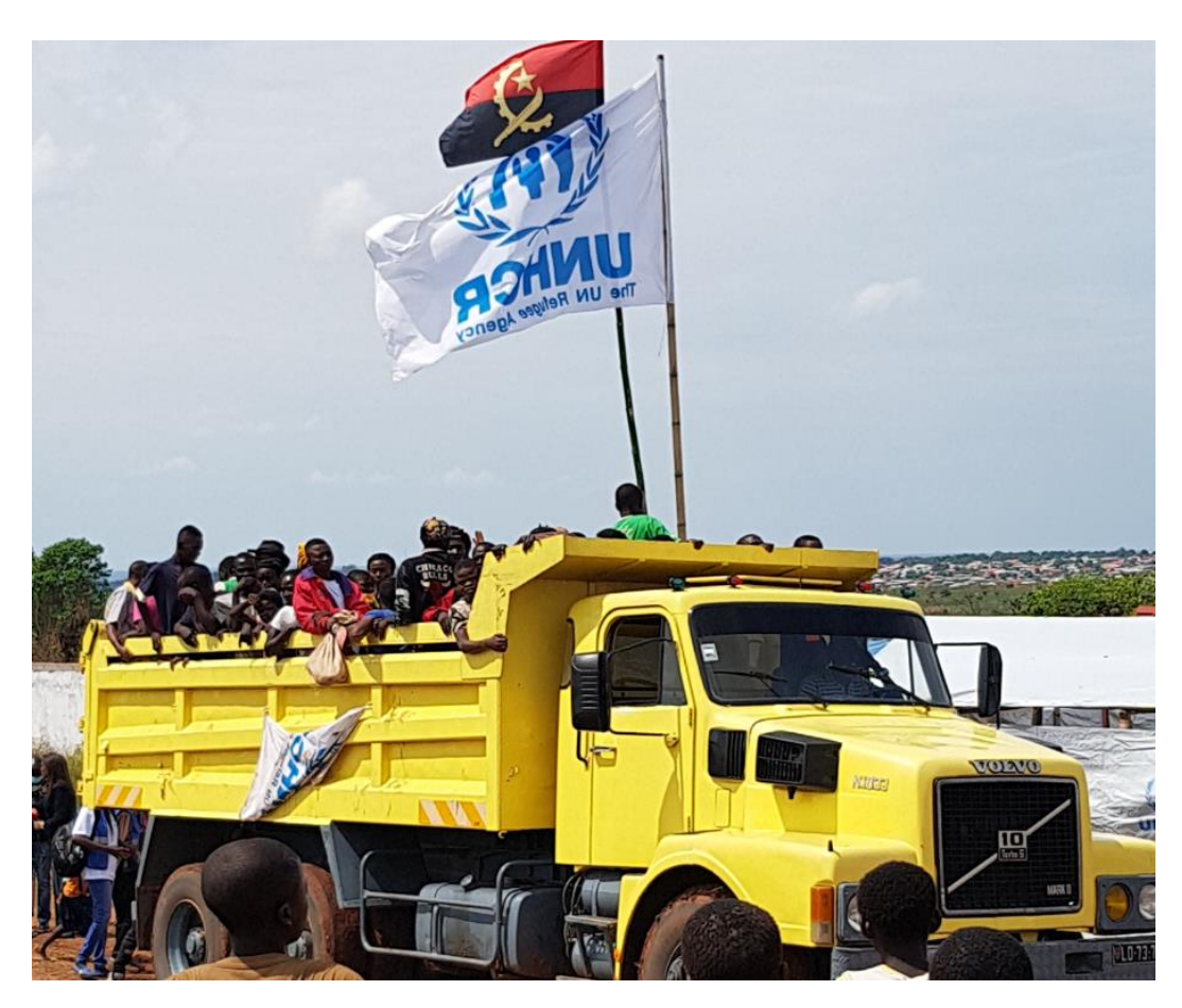
Approximately 500 Congolese are fleeing daily to Angola through various informal border crossings. New arrivals are screened by the Angolan border police and transported by UNHCR to Cacanda and Mussungue reception centres for pre-registration and assistance. Over 23,500 Congolese from Kasai region have arrived to northern Angola since early April.

So far over 23,500 Congolese have fled from Kasai region of the Democratic Republic of the Congo (DRC), mainly from Kamako area, to Lunda Norte Province in Northern Angola. Besides the indiscriminate and brutal violence targeting civilians, the recently reported shortage of food in the Kamako area is forcing people to flee. Although nearly 80 per cent of pre-registered arrivals are women, children and older persons, more men are also crossing the border. Angolan police continues to conduct screening at the border to establish the civilian nature of the new arrivals. Congolese asylum-seekers staying in Cacanda and Mussungue reception centres have indicated to both Angolan and Congolese authorities, as well as to UNHCR, that they do not have immediate plans to return to the DRC due to the insecurity in their areas of origin.