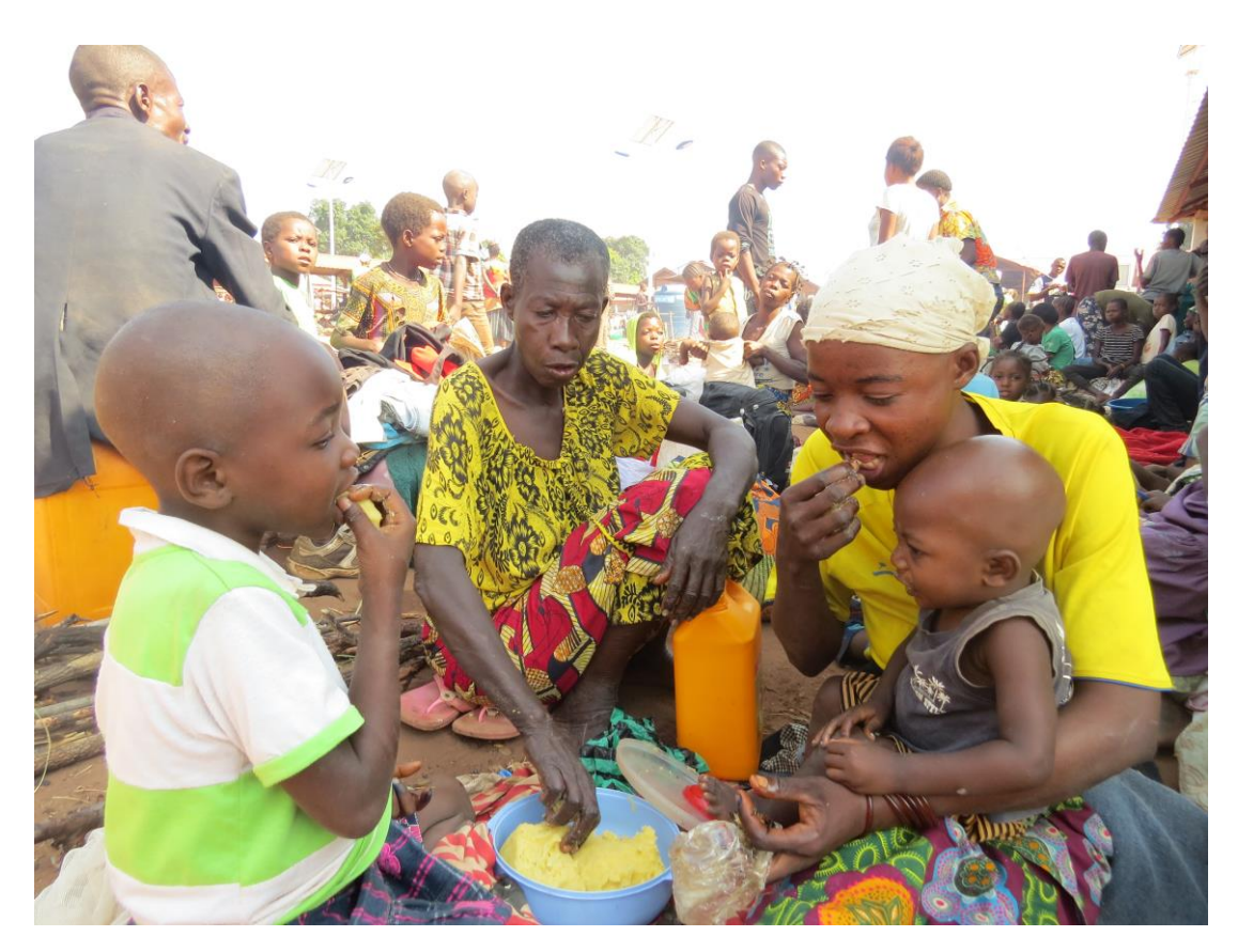
A family who fled Kasai Province, the Democratic Republic of the Congo, eat their evening meal at Cacanda reception centre in Dundo, Angola.