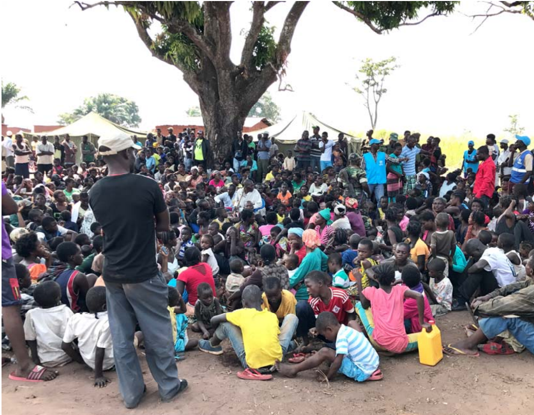
Large groups of Congolese arrivals at “La Curva” waiting for pre-registration on 28 May 2017. A total of 1,254 arrived on this day.

Survivors of brutal and indiscriminate violence are in urgent need of medical and psycho-social treatment. During focus group discussions organized by UNHCR and partners in reception centres, many asylum-seekers have either been subjected to extreme violence including machete cuts, severe burn wounds and Sexual and Gender-Based Violence (SGBV), or they have witnessed atrocities and loss of family members in their places of origin or during the flight.