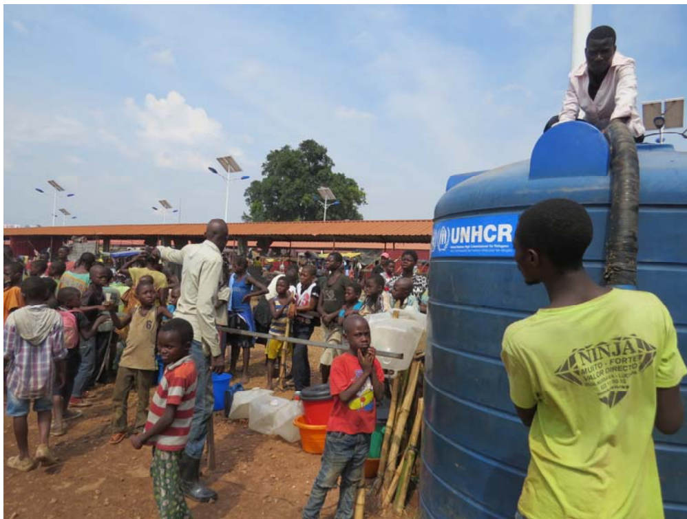
UNHCR is trucking water for drinking and cooking to Cacanda reception centre hosting Congolese asylum-seekers from the Kasai Region. Water is stored in large containers for distribution to some 17, 000 asylum-seekers residing in the centre as well as in surrounding communities. The current water storage capacity at Cacanda reception centre is 32,000 liters.

By increasing the frequency of water trucking as well as the water storage capacity, the sufficient water supply has been established in both reception centres. Water storage capacity in Cacanda is currently 32,000 L while the storage capacity in Mussungue is 15,000 liters. UNICEF and UNHCR are also assessing the viability to drill boreholes as well as to establish distribution systems in reception centres.