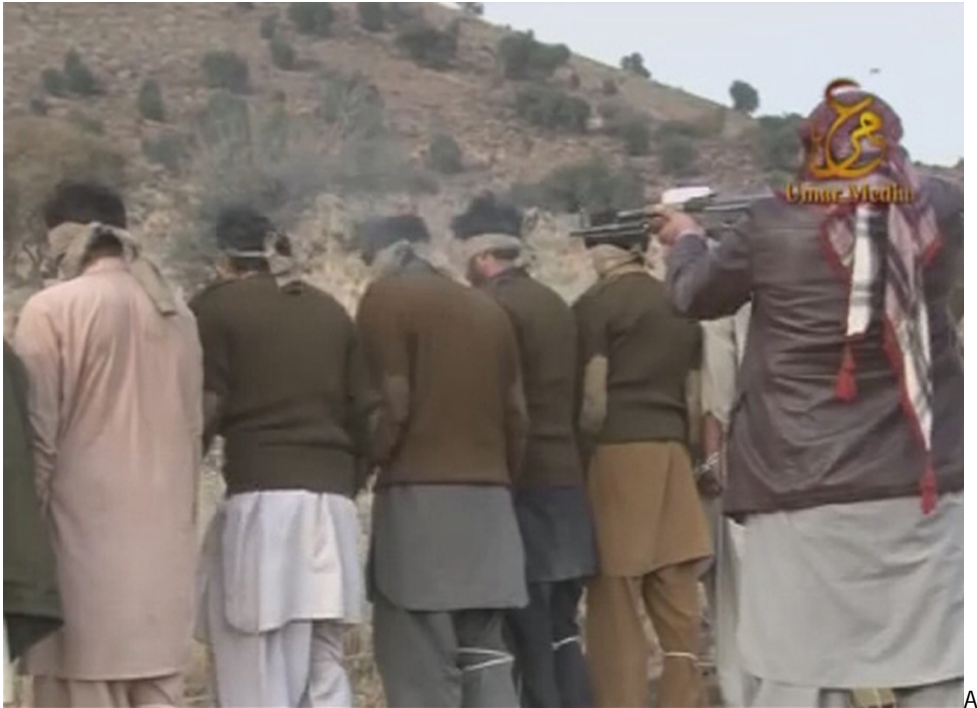
Taliban fighter executes captured Pakistani soldiers on 4 January 2012, the Taliban claims, to avenge the killing of one of its commanders by the Frontier Corps the previous month. The killing of captured soldiers is a violation of international humanitarian law. This still image has been taken from a video obtained by Reuters on 21 January 2012.