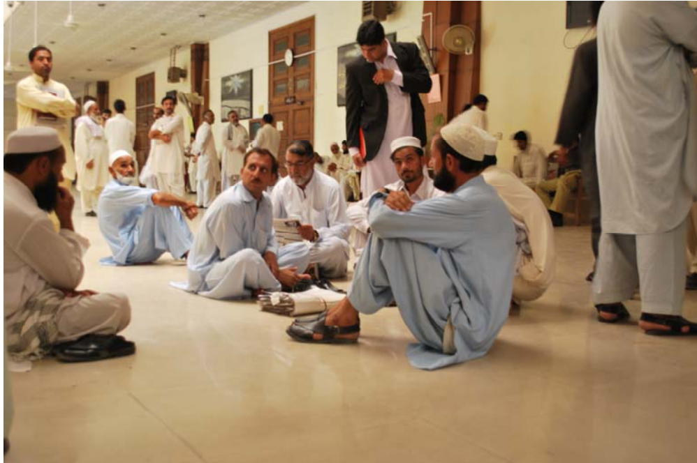
Relatives of men and boys allegedly taken by the Armed Forces in northwest Pakistan wait inside the Peshawar High Court hoping for any information on the fate and whereabouts of their loved ones. 21 August 2012.

international human rights law. The improvements are also rendered almost meaningless by the AACPR.