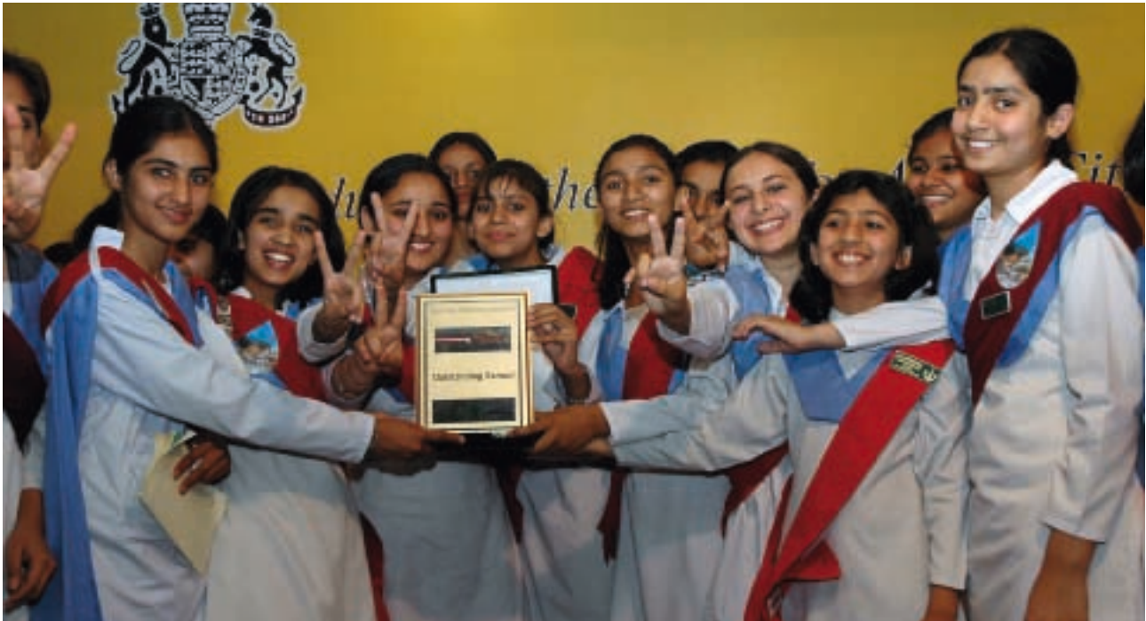
Students from an FCO-funded workshop on “Educating the Young for Active Citizenship” in the Punjab

urge the Pakistani government to commute all death penalty sentences, revise the list of crimes for which the death penalty is applicable in line with the terms of the ICCPR, and improve legal safeguards surrounding capital cases.