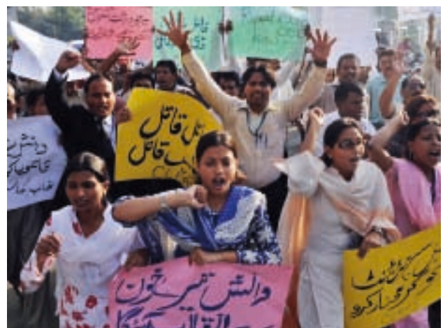
Civil society activists protest the death in custody of a Christian man accused of blasphemy

This direct dialogue is supported by substantial EU financial commitments. Between 2007 and 2010,