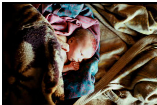
A baby, only a few hours old, was born in an IDP camp in Santipur, Kokrajhar district, Assam, India. Some camps are far from towns or cut off from the NGOs, so the women give birth in the camp.

that full citizenship depends on a person’s membership of one of the country’s 135 officially recognised ethnic groups. In Rakhine state, most of the children born to IDPs belong to the Rohingya ethnic minority, which the government considers illegal immigrants from Bangladesh. 25 Despite the fact that Rohingyas have lived in the area for generations, most of them are stateless and the citizenship law states that they can only register two children per family as “temporary residents”. 26