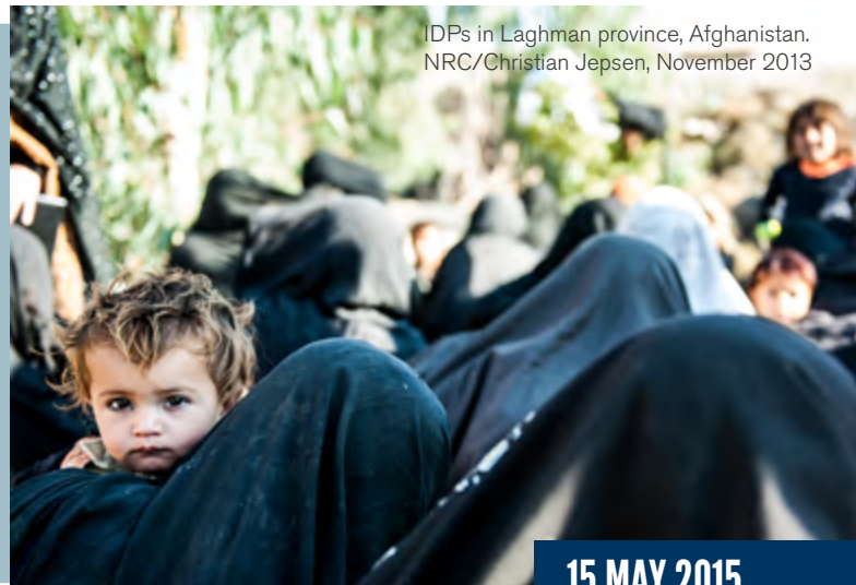
IDPs in Laghman province, Afghanistan. November 2013