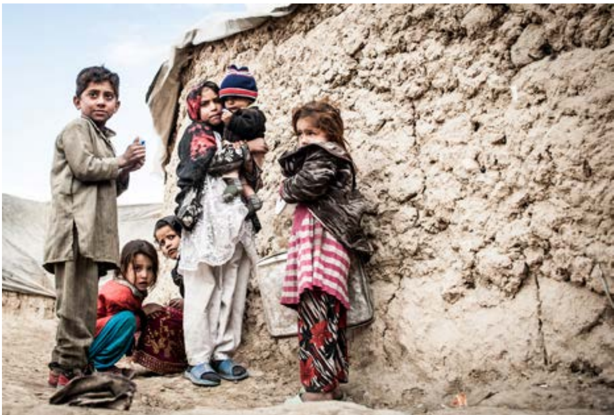
Internally displaced children in Kabul.

Although there have been limited positive changes, the state has insufficiently addressed issues around urban security of tenure. Appropriate legislation and land and housing policies are required to guarantee tenure security and urban development plans must take into account the needs and rights of the poorest and most vulnerable. Widespread land-grabbing for private gain by strongmen,