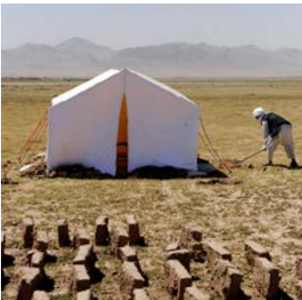
A displaced man puts up his tent in a Emergency Response camp in Herat province of Afghanistan.