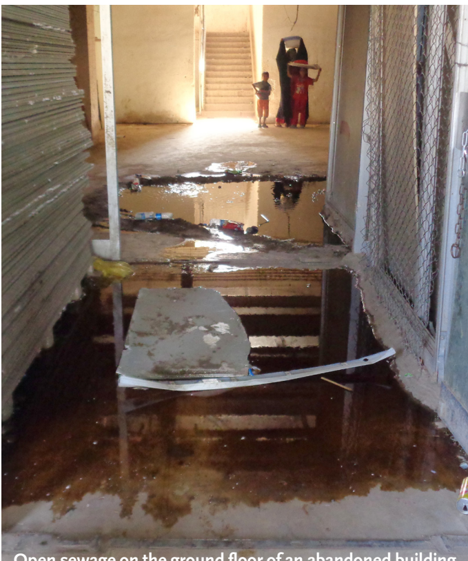
Open sewage on the ground floor of an abandoned building where IDPs are seeking shelter in Anbar.