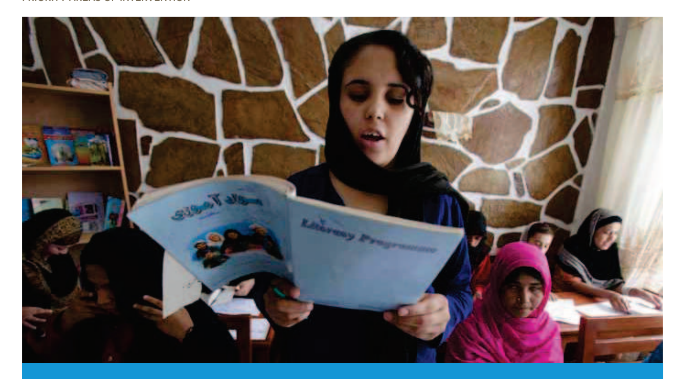
In Afghanistan, UN Women continues to support women's shelters that serve as sanctuaries for women fleeing abuse. Newer efforts involve collecting the first systematic data on violent practices, which will inform new strategies to stop them.