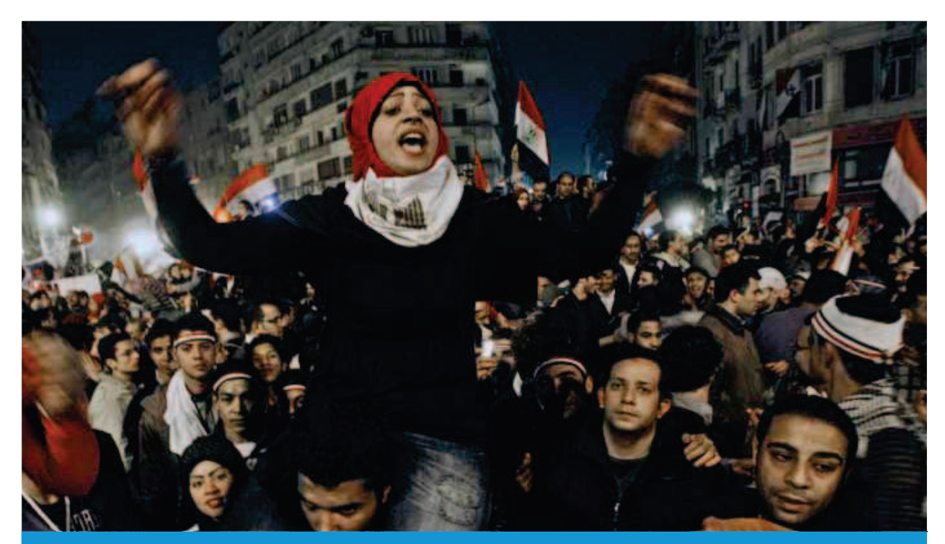
Egyptian women were central to the revolution. UN Women supported women's advocates to form coalitions, and issued a charter calling for women's fair representation throughout the democratization process.