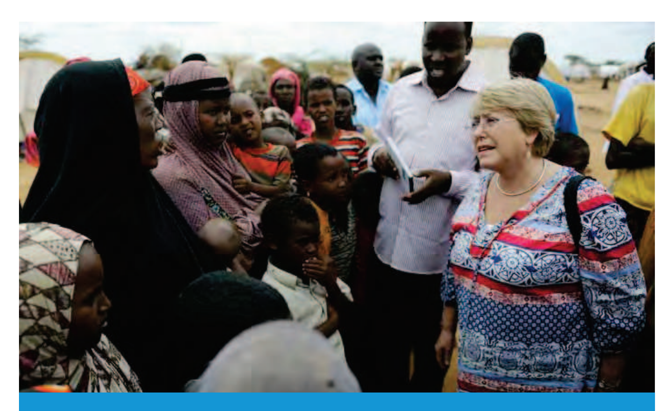
UN Women will champion gender equality in every corner of the world. Executive Director Bachelet visits the Ifo refugee camp in northern Kenya to assess the security situation of Somali refugee women and girls.