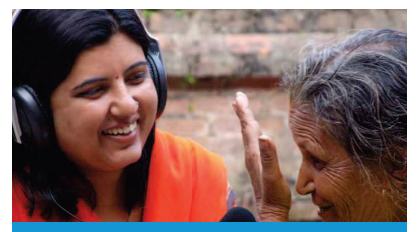
Supported by the UN Trust Fund to End Violence against Women, the group Equal Access in Nepal has broadcast weekly radio shows featuring stories about women's experiences with violence, and HIV and AIDS. The number of women seeking help has doubled.