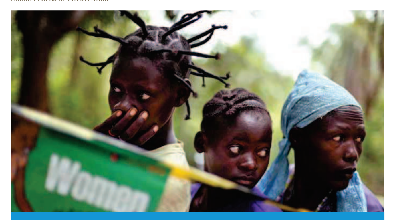
Women made their voices heard in Sudan's 2010 elections, turning out in record numbers after 24 years of war. Quotas for women elected were reached and surpassed, and new women legislators are already lobbying hard for gender equality.