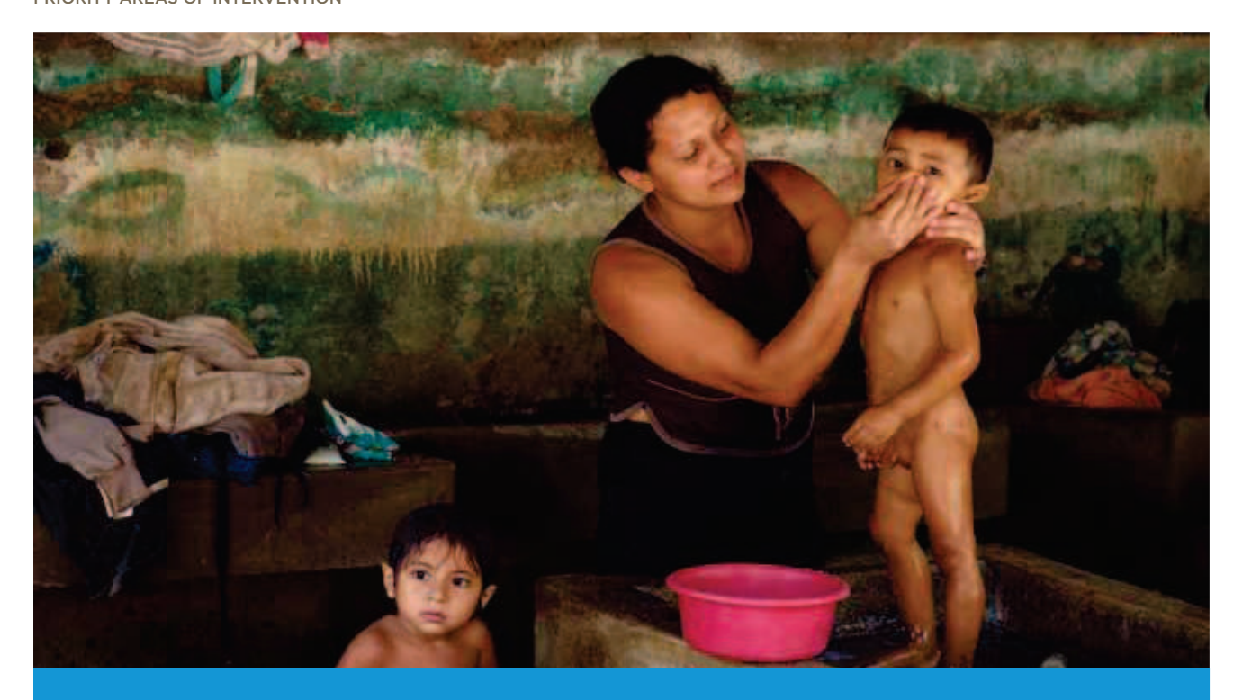
Work at home is typically invisible in national surveys used to guide national plans and budgets. El Salvador now factors unpaid work into its surveys. The time mothers spend on caring for their children, for instance, has become part of the bigger picture.