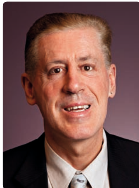
Graeme Innes AM Disability Discrimination Commissioner

Disability Discrimination Commissioner Australian Human Rights Commission