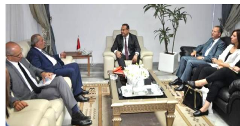
UNHCR meeting with the Tunisian Minister of Civil Society and Human Rights, 28 September.