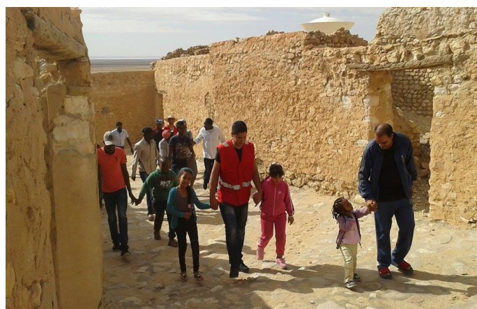
Go-and-see visit organized by UNHCR's partner IRT in Tozeur for 30 refugee children and youth from 29 to 31 October.