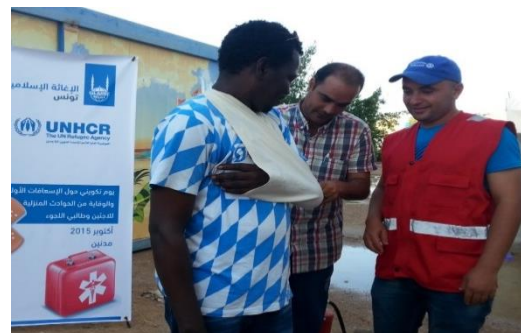
First aid training conducted on 15-16 October for refugees in Medenine.