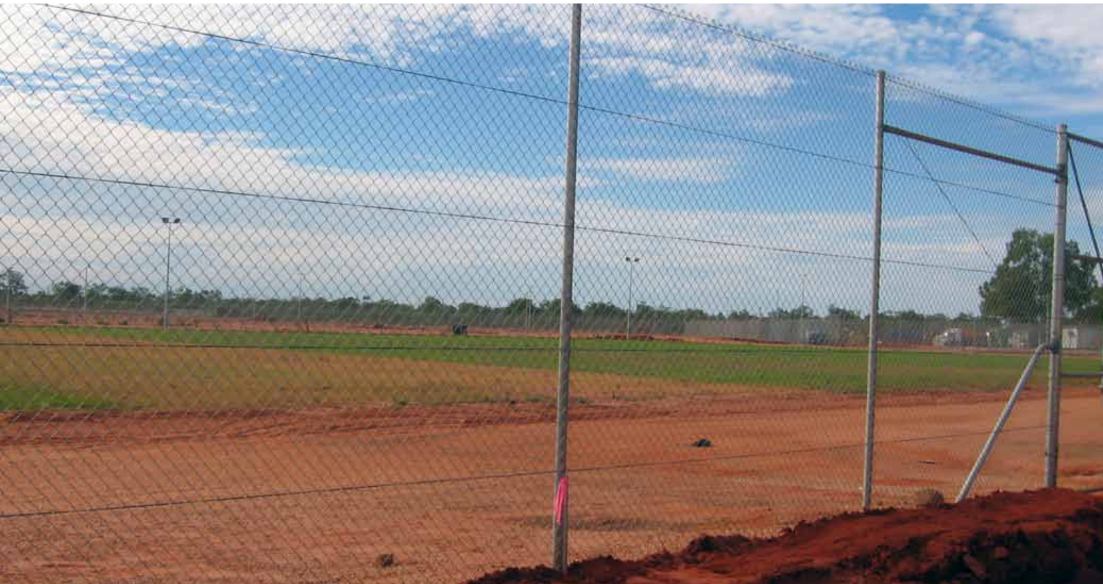
Looking out from inside the Curtin IDC perimeter fence over the unfinished oval.

This included additional exercise equipment and new sporting competitions and music classes. The Commission welcomes this increase. Some detainees claimed it was organised because of the Commission's visit and they were sceptical that it would continue. Serco has assured the Commission that it will.