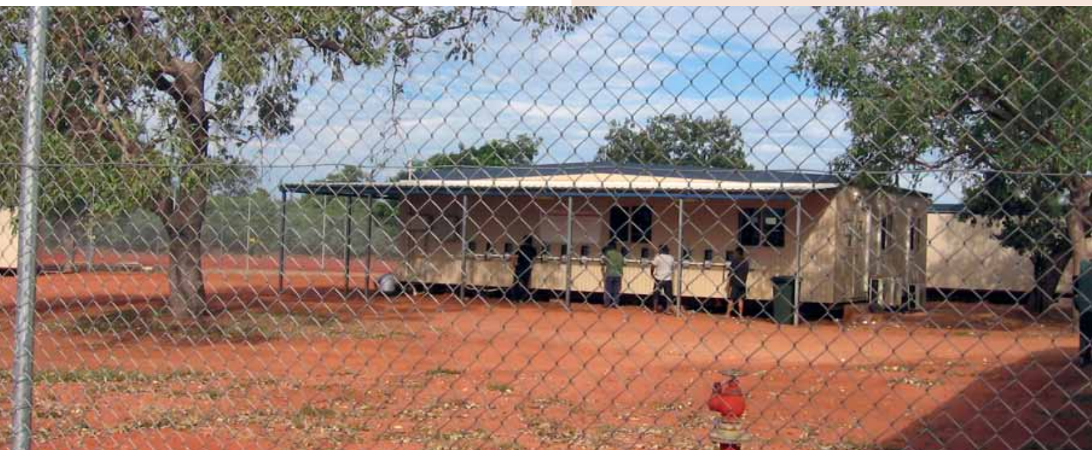
People in detention using outdoor telephones, Curtin IDC.