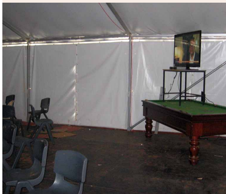
Marquee used for recreation, Curtin IDC.