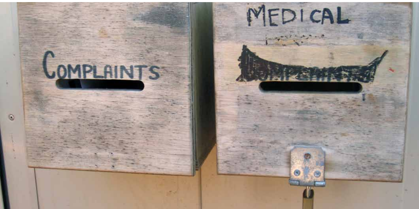
Unlocked complaints box next to locked medical request box, Curtin IDC.

Further, the Commission urges DIAC and Serco to ensure that staff training and performance management mechanisms include a strong focus on treating all people in detention with humanity and with respect for their dignity; that all staff refer to people in detention by their name; and that people in detention are able to lodge both internal and external complaints confidentially and without fear of repercussions.