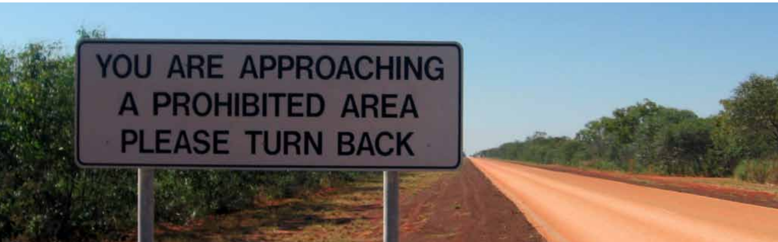
Approaching Curtin IDC on the Curtin Royal Australian Air Force base.