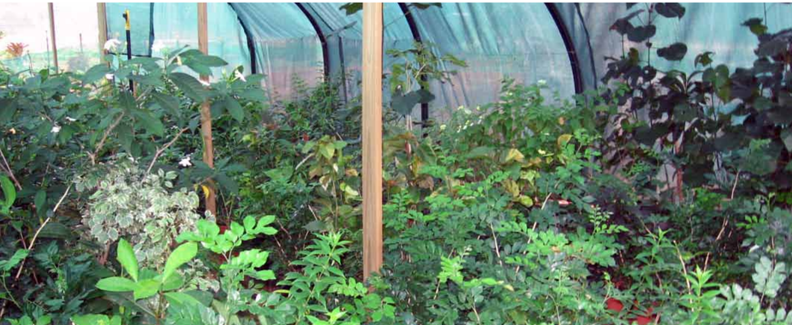
Garden area in 'Aqualand', Curtin IDC.