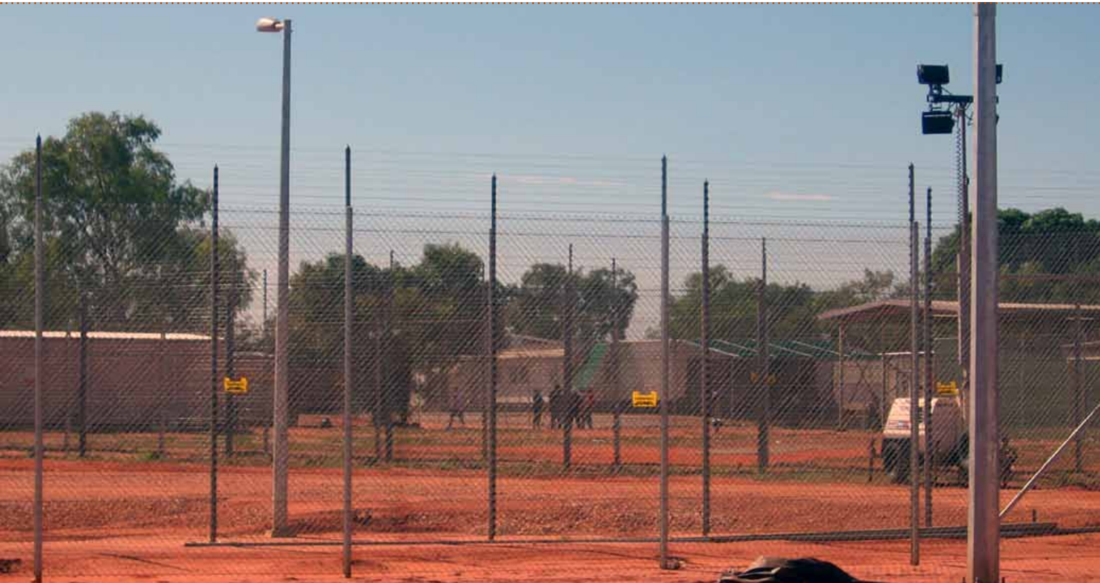
Looking into Curtin IDC through perimeter fence.

Curtin IDC is located at the Curtin Royal Australian Air Force base, approximately 40 kilometres south-east of Derby in Western Australia. Derby is approximately 2500 kilometres north-east of Perth, and has a local population of around 3000 people. 13 The previously named Curtin Immigration Reception and Processing Centre was opened in September 1999 and closed in September 2002. The site was re-opened as Curtin IDC in June 2010.