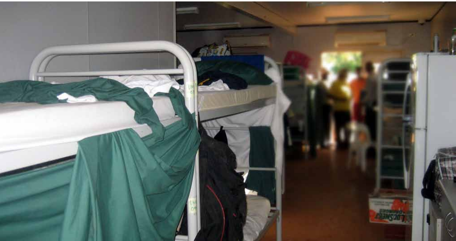
Dormitory bedroom, Curtin IDC.