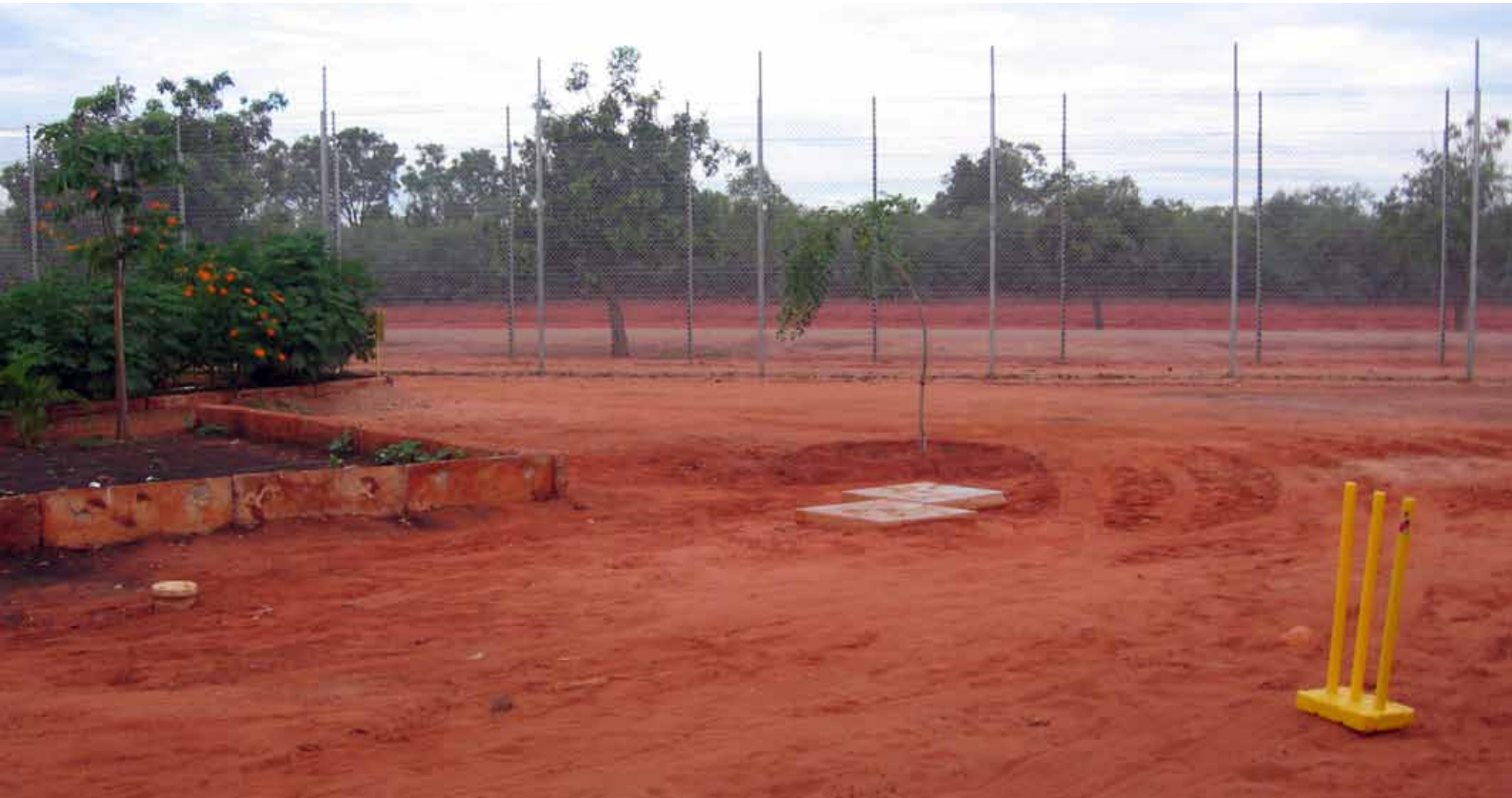
Dirt area used as cricket pitch, Curtin IDC.