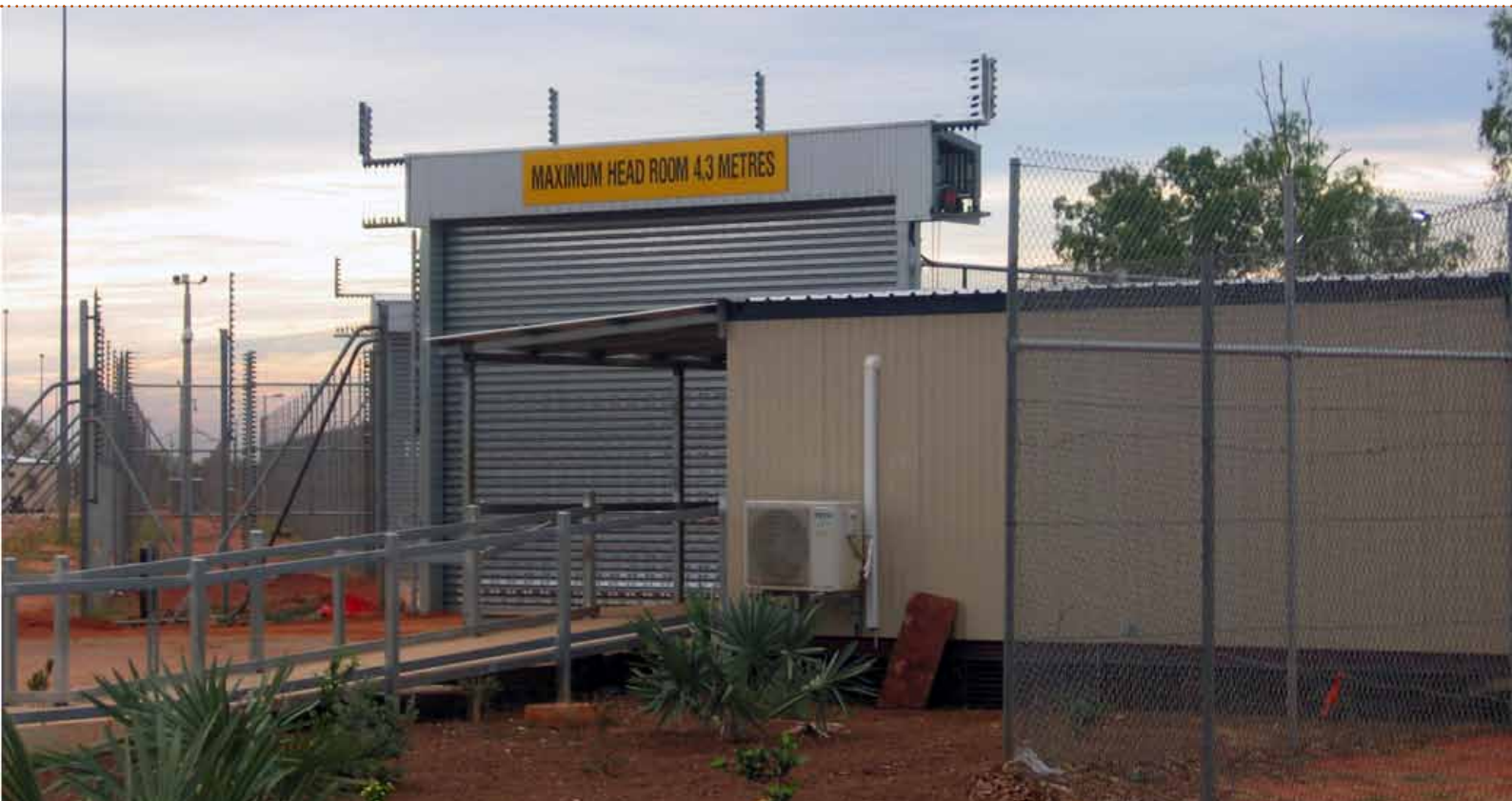
Entrance to Curtin IDC.

The Commission acknowledges that the use of immigration detention may be legitimate for a strictly limited period of time. However, the need to detain should be assessed on a case-by-case basis taking into consideration individual circumstances. A person should only be held in an immigration detention facility if they are individually assessed as posing an unacceptable risk to the Australian community and that risk cannot be met in a less restrictive way. Otherwise, they should be permitted to reside in community-based alternatives while their immigration status is resolved – if necessary, with appropriate conditions imposed to mitigate any identified risks.