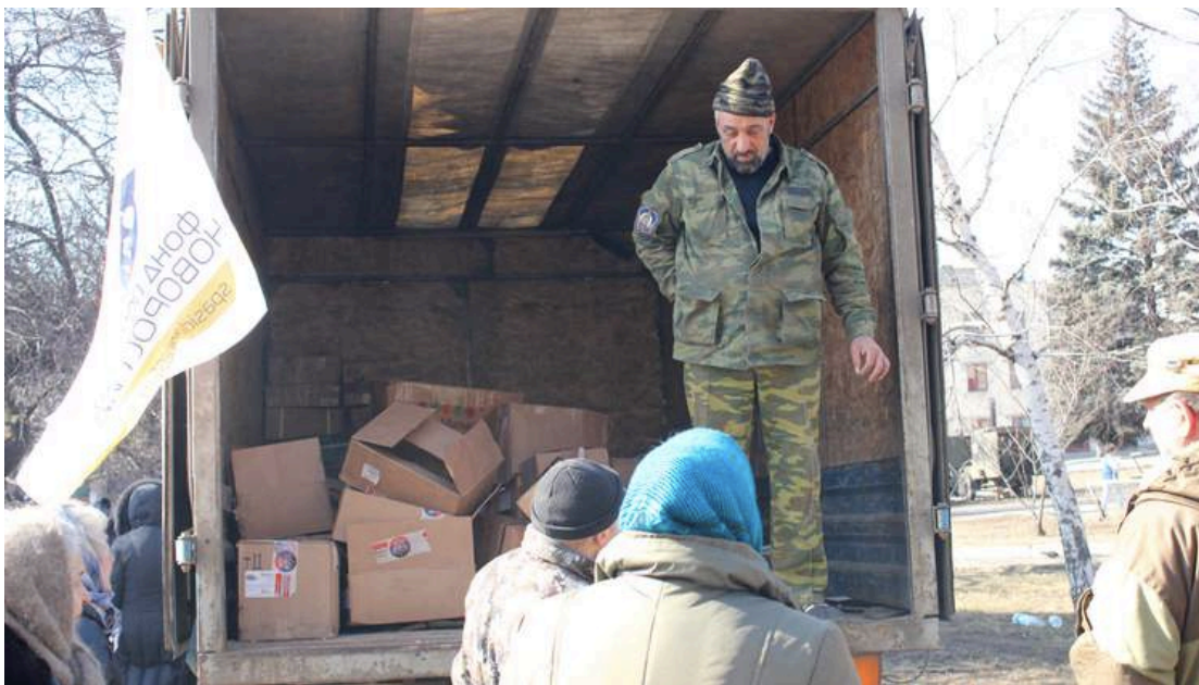
Rebels have been distributing limited amounts of aid

A limited number of aid convoys do cross quite regularly from the west, but they can't access certain areas, especially villages in lawless Luhansk region far from crossing points, down minor roads. Some help is provided by the Russian government, but it isn't clear how widespread or regular this assistance is.