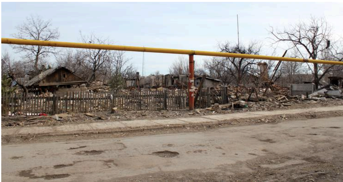
A residential street in Zorynsk: there used to be a house in the foreground, but it was completely obliterated.

On one street, pieces of wood are scattered across a lawn. Those few beams are all that is left of an entire house. It would be impossible to tell had it not been for another badly shelled house next door.