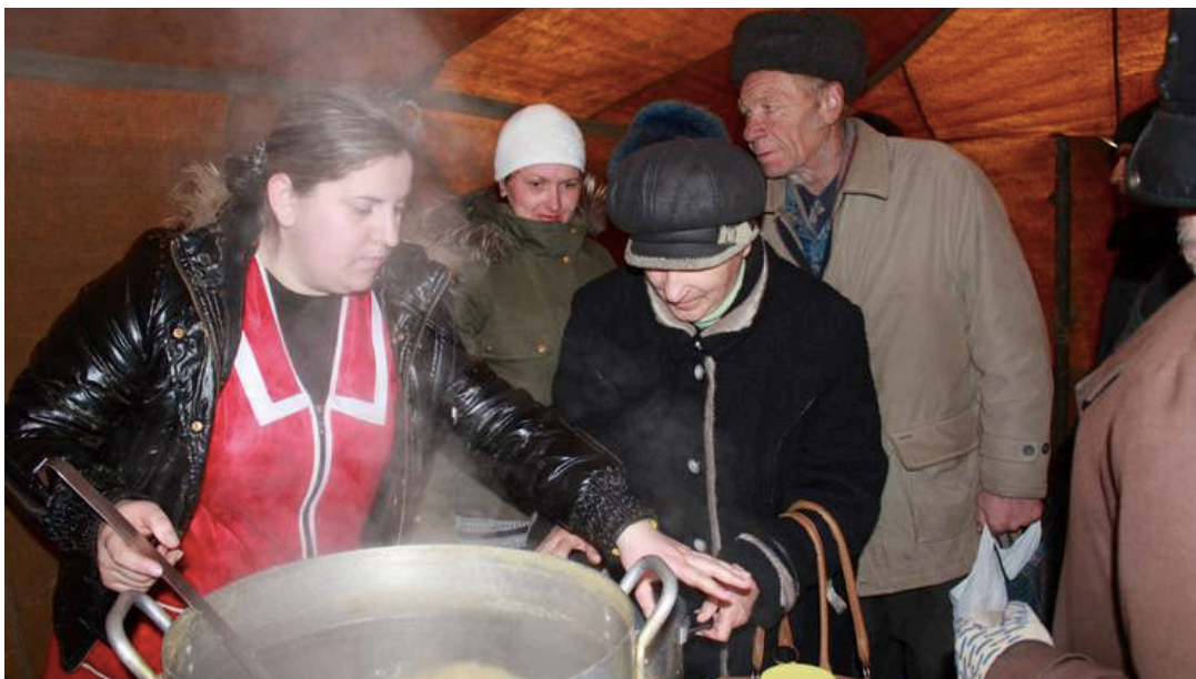
Soup kitchens, like this one run by the local Red Cross in Luhansk, are the only source of regular food for some

Many people in the rebel-held part of Luhansk region have to rely on soup kitchens run by separatists. Apart from MSF and ICRC, few international aid organisations have a consistent presence here, where the humanitarian crisis is worst.