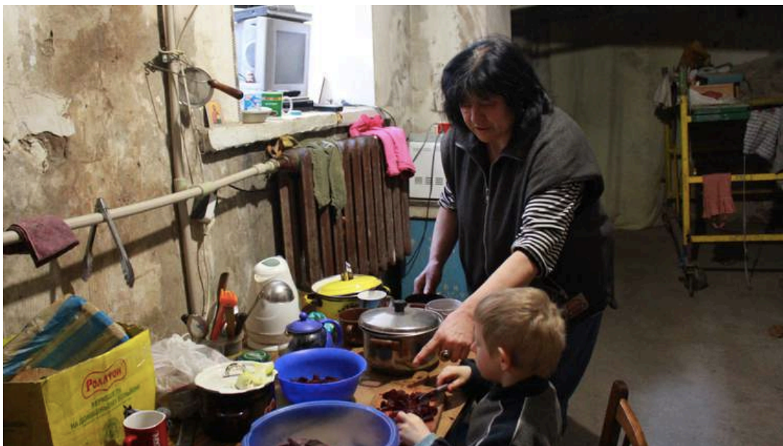
Families spent the winter months living in underground shelters

Most of the estimated 1.2 million Ukrainians in need of assistance in rebel-held Ukraine can't keep crossing to and fro like Vasilivna to make ends meet. Many have no income at all and are reliant on whatever aid comes their way.