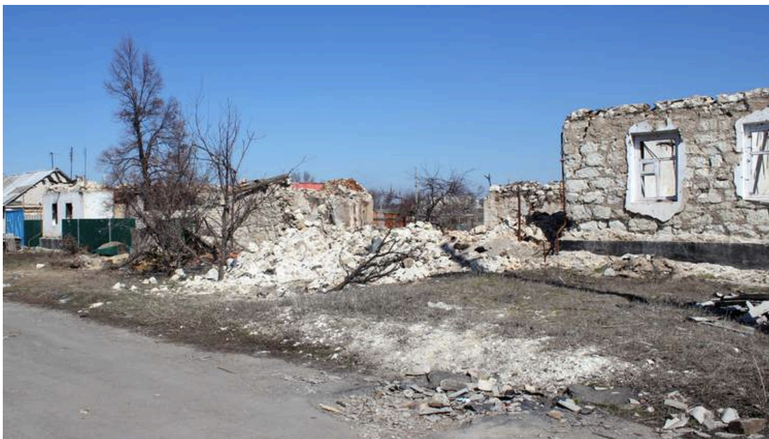
Novosvitlivka has been badly damaged by heavy shelling