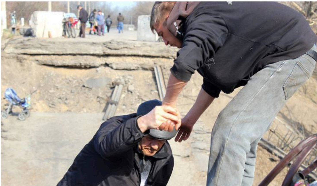
A destroyed bridge marks the border between government and rebel-held territory in eastern Ukraine

Credit cards, banks and ATMs don't function at all in the rebel-held east. People are cut off from all the services the Ukrainian state would usually provide, such as pensions and benefits. The government made an official announcement in November, but locals say the funds dried up months before that.