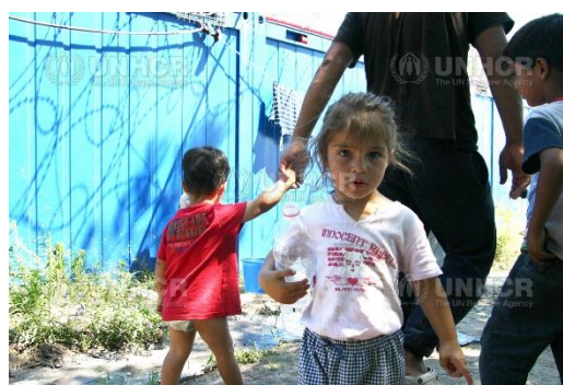
A young girl on her way to collect water at Rösztke makeshift refugee camp, near the Hungary-Serbia border.