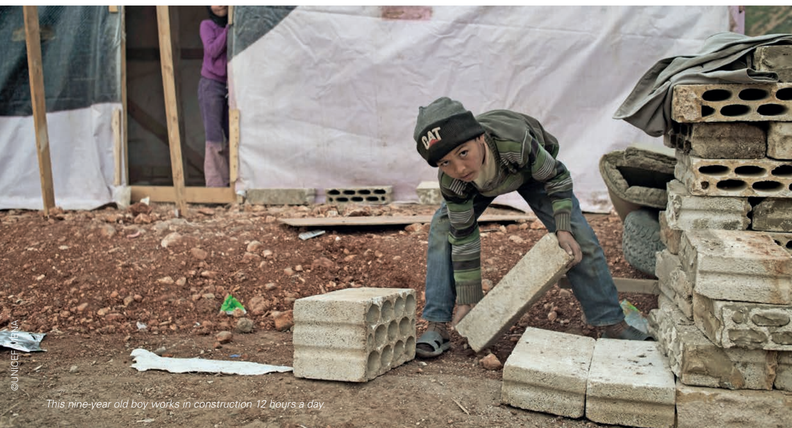
This nine-year old boy works in construction 12 hours a day.

Despite the lack of recent large-scale assessments of child labour, there is no shortage of evidence that the Syria crisis is pushing an ever-increasing number of children towards exploitation in the labour market. The data that are available are probably an under-estimate: Employers and vulnerable families tend to hide the problem, fearing the consequences of disclosing it. In the Za'atari refugee camp in Jordan, heads of households reported that 13.3% of children aged between seven and 17 years old were working. However, when children themselves were asked whether they had worked during the preceding week, a much higher percentage (34.5%) 12 said they had.