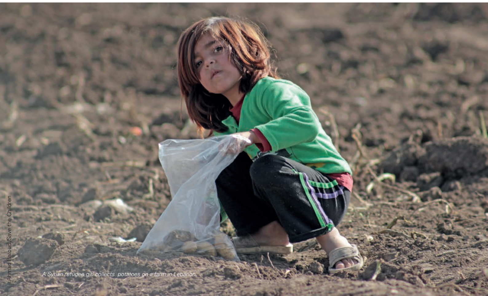
A Syrian refugee girl collects potatoes on a farm in Lebanon.

1 IN 3 STREET BASED CHILDREN IN LEBANON ARE GIRLS.