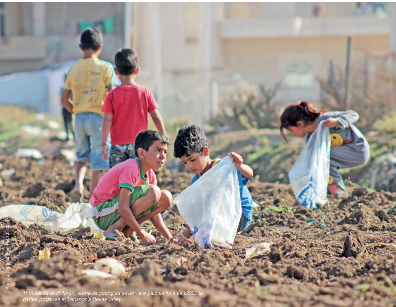
Thousands of children, some as young as seven, are paid as little as US$2 to gather potatoes in Lebanon's Bekaa Valley.

A rapid assessment of child labour in Lebanon found that almost a third of working children were under 14. The report found children of 6, 7 and 8 years old in the north of Lebanon who had been working for at least six months 23 .