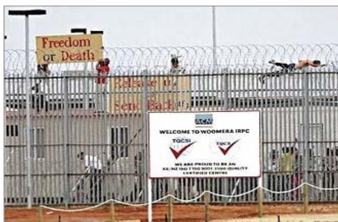
Mahzer Ali leaping onto the razor wire at Woomera on 10 February 2002 against the treatment of children in detention. The banner reads: “Freedom or Death”.