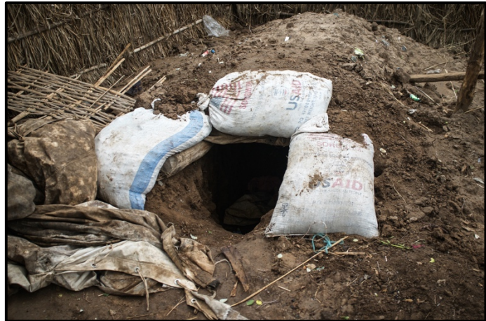
A shelter in a village in southern Kurmuk County, Blue Nile, May 2016 (© anonymous photographer/IRRI).

The conflicts in Darfur, Southern Kordofan and Blue Nile have been ongoing for years, and there are no signs that Khartoum intends to change its national priorities or ruling model any time soon in order to bring them to an end. Negotiations on peaceful solutions to the conflicts in the Two Areas have repeatedly collapsed, and neither side appears to be able to bring the conflict to an end by military means. Moreover, following the failure of the CPA, it is perhaps clearer than it ever was that stopping the violence is just the first step in ending the conflict in Blue Nile State – as in other parts of Sudan. Civilians are aware that the crisis may last for a very long time, and with a political impasse at home and minimal international attention, they also know that the only thing they can do is rely on their own resilience and ability to adjust to the brutal circumstances.