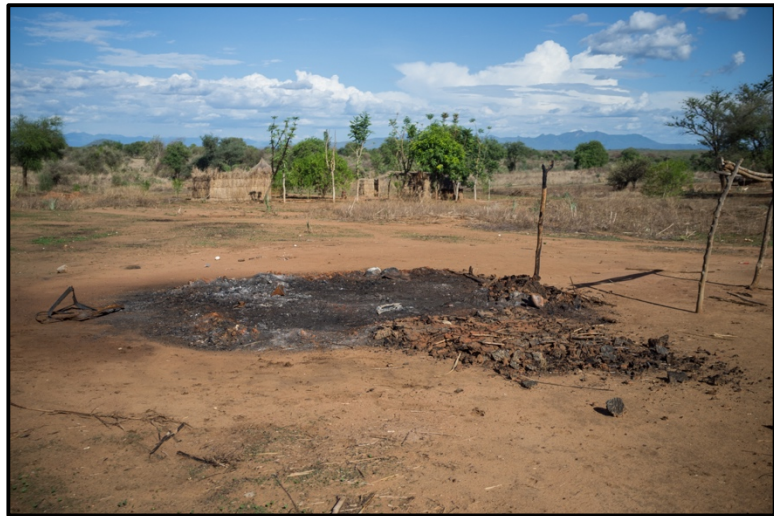
A burnt hut in a village in southern Kurmuk County, days after it was bombed, May 2016.

Although many civilians have learned to recognise the sound of approaching planes and have dug foxholes in an attempt to provide themselves with some shelter during raids, the bombs still often claim lives or cause terrible injuries, kill livestock, and destroy crops and private property. In addition, the indiscriminate nature of the attacks, and the fact that they can take place at any time, has had a terrible psychological impact on the population. The sound of the planes, sometimes lingering in the