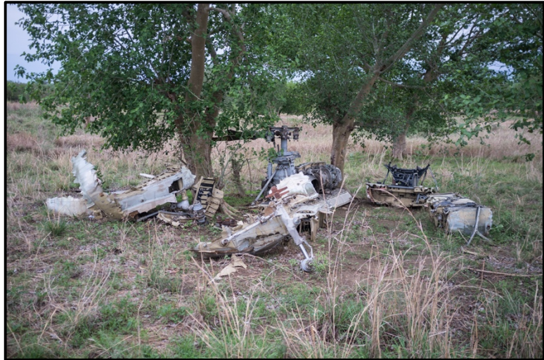
Yabus: the remains of a military helicopter that was allegedly shot down during fighting in 1996 (© 2016 anonymous photographer/IRRI).

The CPA provided a formula for democratic transformation and the creation of a “New Sudan”. The transitional period was designed to allow these changes to take root and to build confidence between the north and the south. Southerners, however, were given the option of a referendum and secession in the event that these changes were not implemented to their satisfaction. The north-south division in the CPA was based on