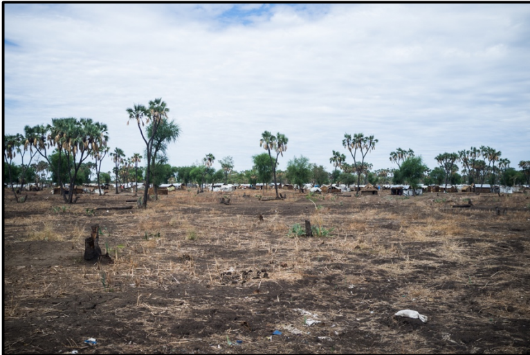
The outskirts of Doro refugee camp, South Sudan, May 2016 (© anonymous photographer/IRRI).

However, access to natural resources is not the only issue behind the conflict between refugees and host communities. Maban County has stood, most notably since mid-2014, at the intersection of two