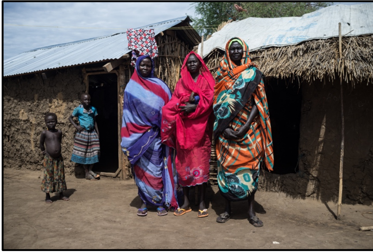
Women from Wadaka (Kurmuk County, Blue Nile) in Doro refugee camp (© 2016 anonymous photographer/IRRI).

Nile,” explained one refugee living in Doro. 68 Another refugee from Roseires argued that “the original Sudanese are Funj.” 69