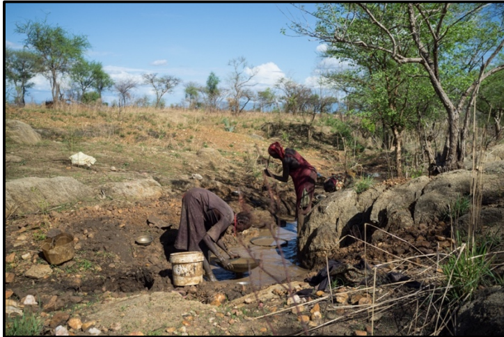
Artisanal gold mining in southern Kurmuk County, Blue Nile State, May 2016 (© anonymous photographer/IRRI).

Under these circumstances, humanitarian assistance in the SPLM-N held territories is extremely limited, and the few local organisations operating in these areas refrain from publishing information on the amount of assistance that they are providing. A few local initiatives of humanitarian assistance were mentioned by