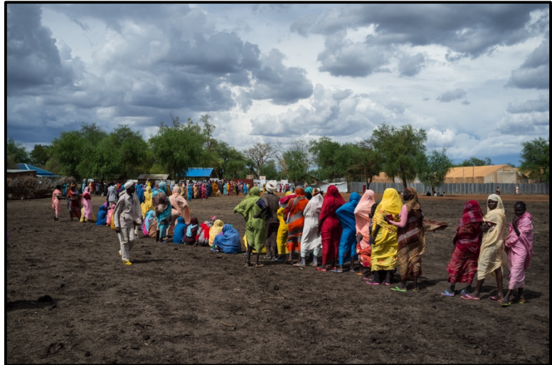
Clothes distribution in Gendrassa refugee camp, South Sudan (© 2016 anonymous photographer/IRRI).

Perhaps the most evident impact of the displacement, on those civilians who had to leave their homes, has been the loss of livelihoods and property, and the growing dependency on aid. As most communities maintained an agro-pastoral lifestyle before they fled, the loss of land, and in many cases also livestock, has been critical. 129 A community leader in Yusuf Batil explained: “We were farmers. We could provide for ourselves. We raised cattle. These are the two things we were dependent on. When this war started we lost everything.” 130 Another man in Doro refugee camp said: “We had enough food. Now we eat much less. People cannot work the land. Now we are in a problem: you want to feed your children but you don’t have any options. All the people are looking for help from NGOs but the aid is not enough.” 131