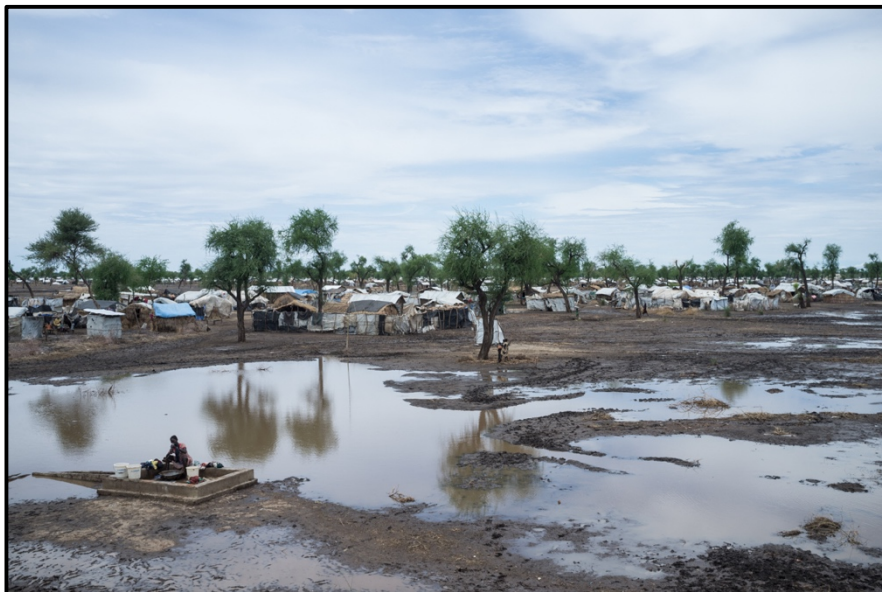
Yusuf Batil refugee camp, South Sudan (© 2016 anonymous photographer/IRRI).

Field research was carried out in collaboration with NHRMO. Interviews were carried out with 36 civilians from different areas in Blue Nile State, and from different, though predominantly “indigenous” Funj, 3 communities. Most interviewees were refugees in South Sudan, but internally displaced and non-displaced civilians in Sudan were also interviewed. Most interviews were conducted in Arabic, a few were conducted in English, and some were also conducted in Uduk and Jumjum, with translation into English. In addition, interviews were also carried out with individuals affiliated with NGOs working in South Sudan or Blue Nile, and with some SPLM-N officials. Desk research was carried out in order to contextualise the findings.