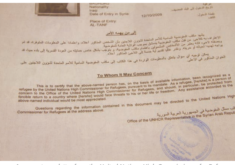
An acceptance letter from the United Nations High Commissioner for Refugees.

passport.<sup>79</sup> Applying for a passport also requires interfacing with a government agency, with the risk of being seen as an LGBT person and an easy victim of extortion for bribes.