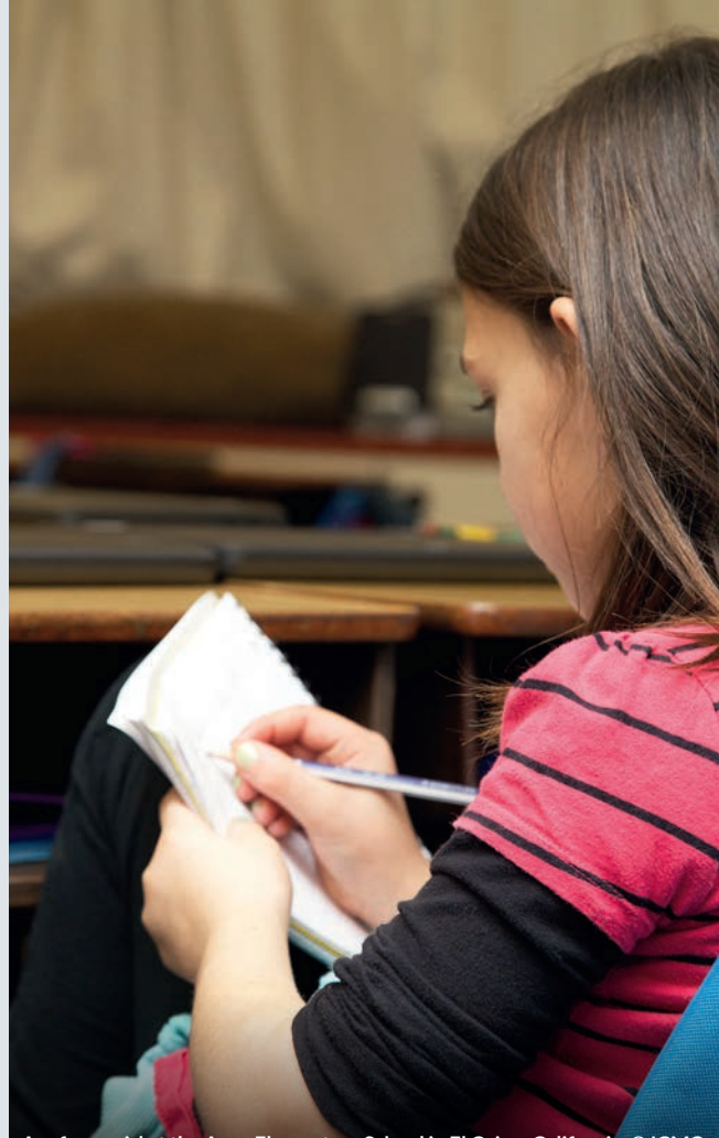
A refugee girl at the Anza Elementary School in El Cajon, California.

Through its liaison office in Washington DC, ICMC continued to ensure that the refugees resettled to the United States from its Resettlement Support Center in Turkey and Lebanon experience a smooth transition to their new country.