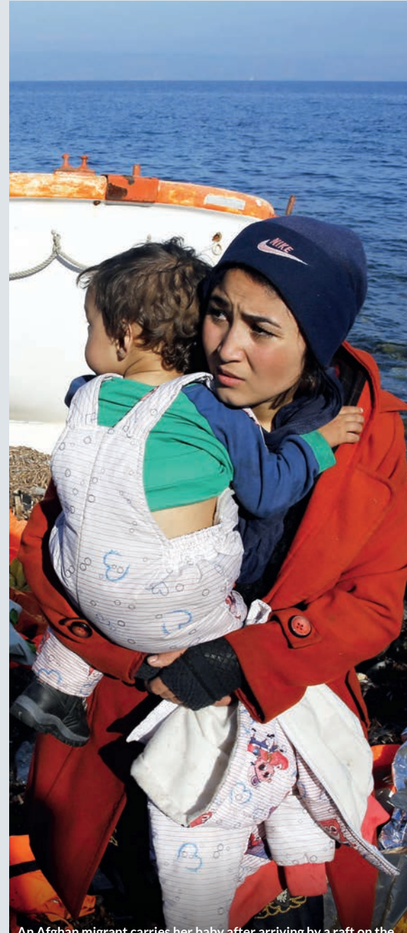
An Afghan migrant carries her baby after arriving by a raft on the Greek island of Lesbos in November.