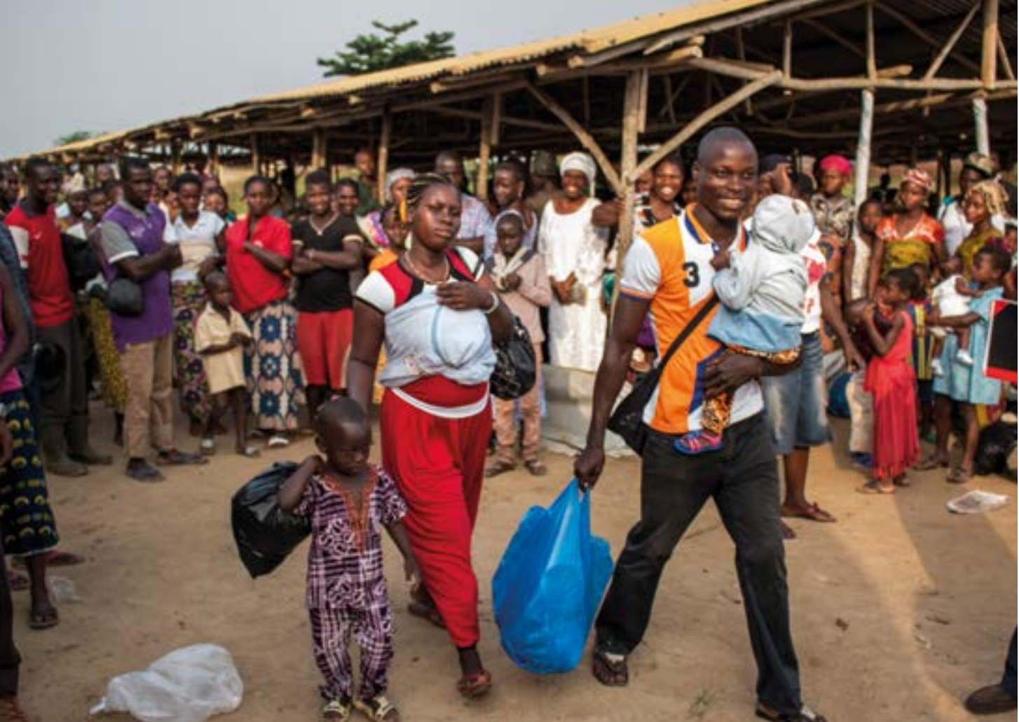
Ivorian refugee family prepares to board the truck that will take them to Côte d'Ivoire. Of 38,000 Ivorian refugees living in Liberia's three refugee camps, 11,000 have expressed their willingness to return home immediately. © UNHCR / D. Diaz / December 2015