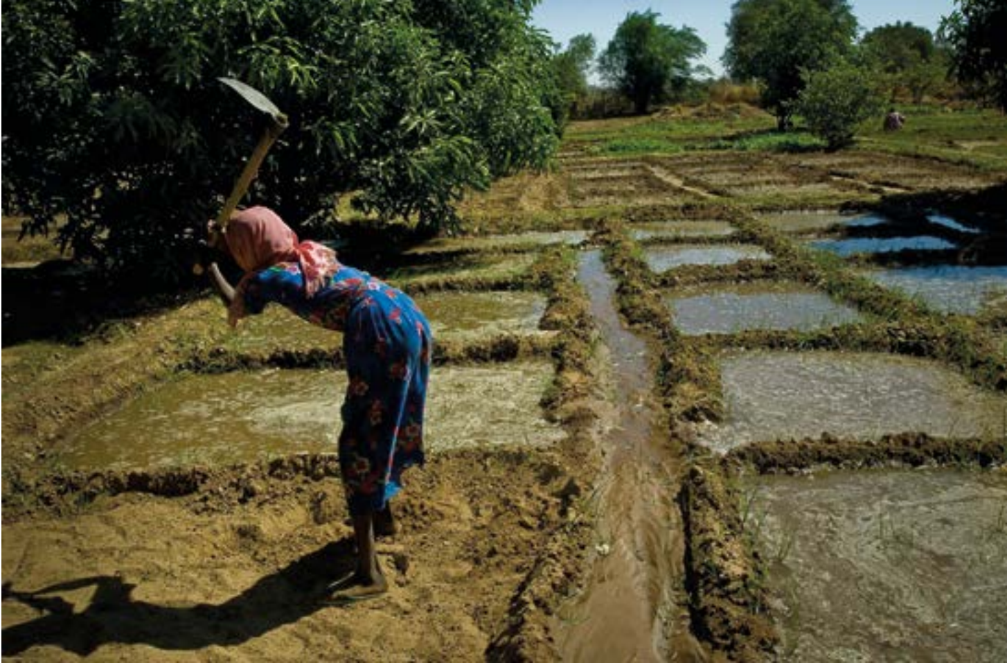
A young refugee separates her market garden into areas for watering. She received the plot as well as technical advice from an agricultural expert through a programme of Africare, an NGO partner of UNHCR.