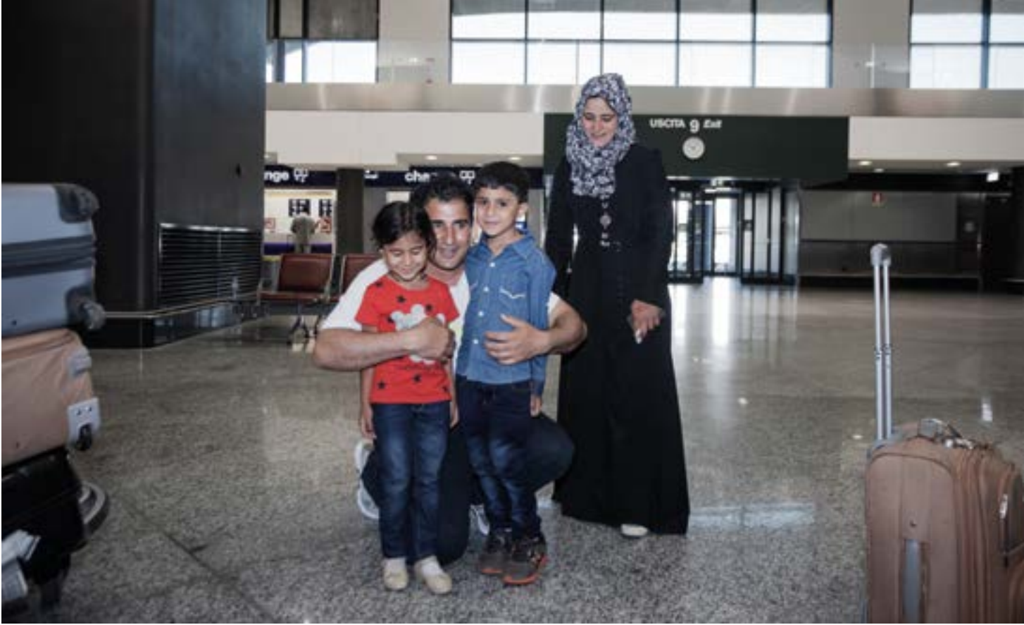
At Malpensa Airport, an Egyptian refugee living in Milan is reunited with his wife and children after two years separation.