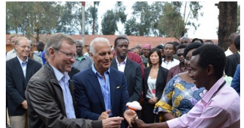
CEO of Ikea and UNHCR Representative inaugurating Kepler Classroom in Kiziba camp.