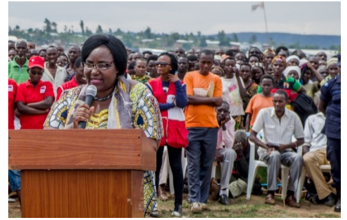
Minister of MIDIMAR addressing Burundian refugees in Mahama camp.